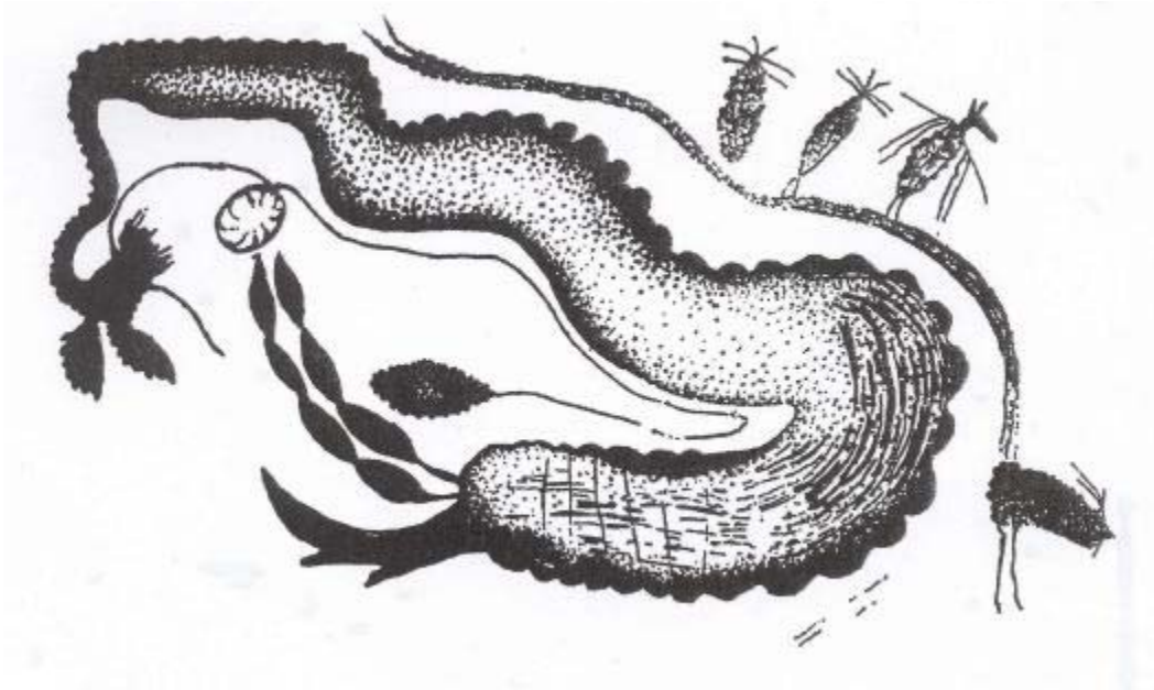
Figure 1: Composite Rainbow Snake, Arnhem Land rock art. (Lewis 1988: 272)

recognisable features; they are juxtaposed but not obliterated, allied but not subsumed.