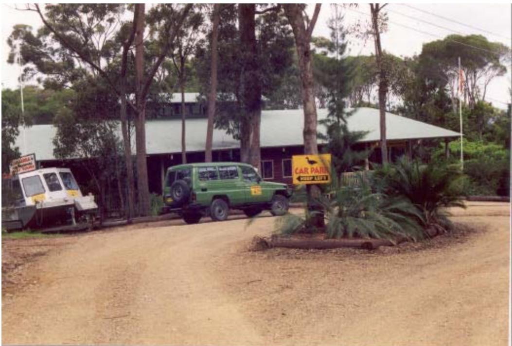
Photos 1 and 2: The black duck at Umbarra Cultural Centre, Wallaga Lake