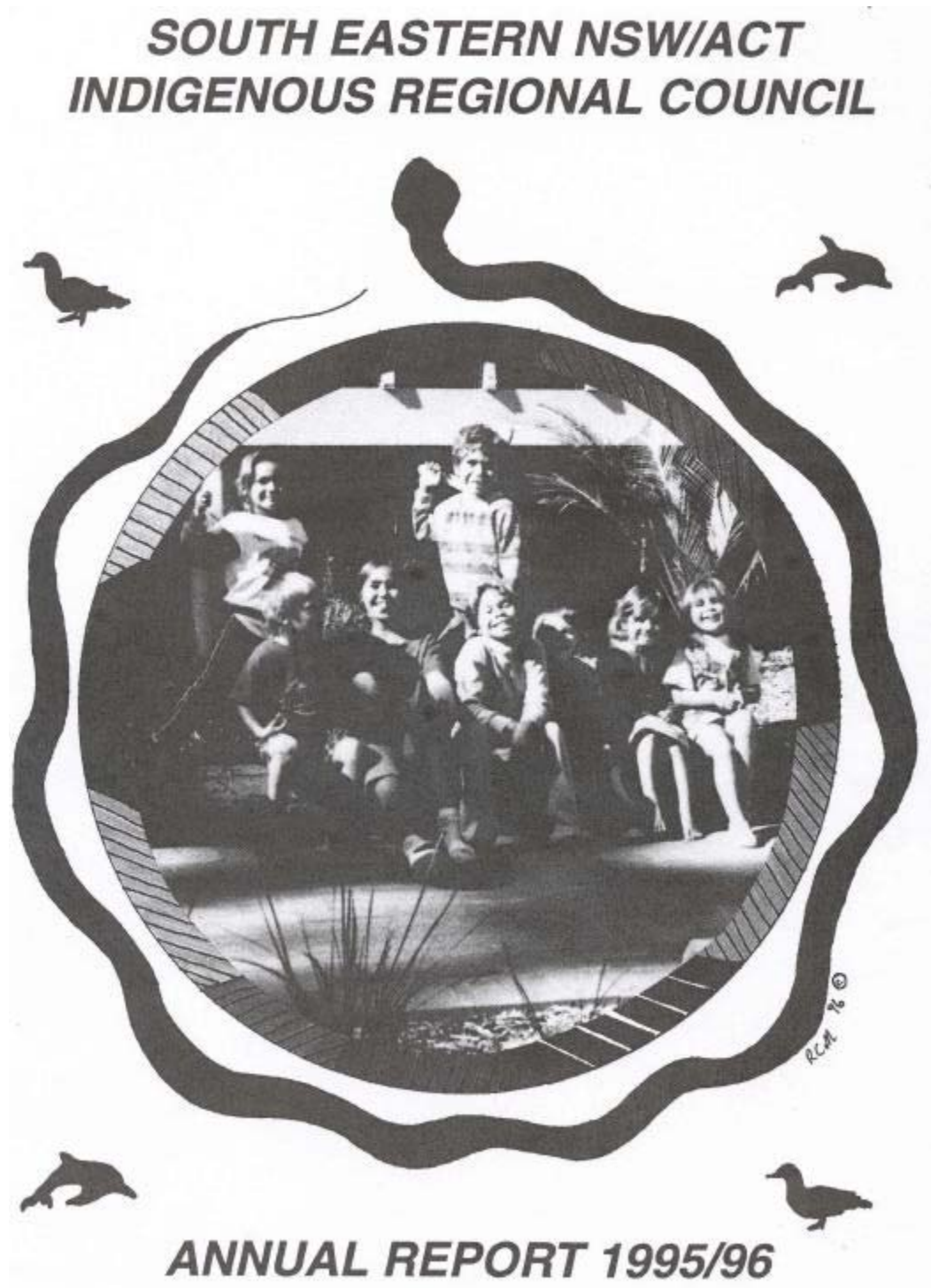
Figure 2: report cover

Snake or Serpent are being used in the same way. The apparent continuity of a system for managing major change is impressive.