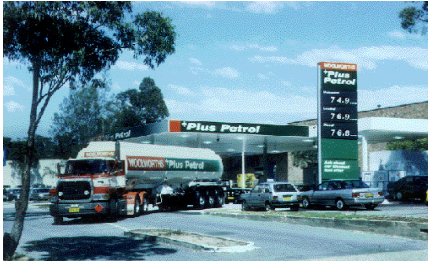
Green Hills NSW

In 1996 Woolworths announced that it would introduce petrol outlets within car parks of their existing Woolworths supermarkets. These outlets would concentrate on essential services including petrol, water, oil and air and offer low-cost petrol to Woolworths customers. The first opening was at Orana Mall Shopping Centre, Dubbo, NSW in December to be followed by others, initially mainly in country areas.