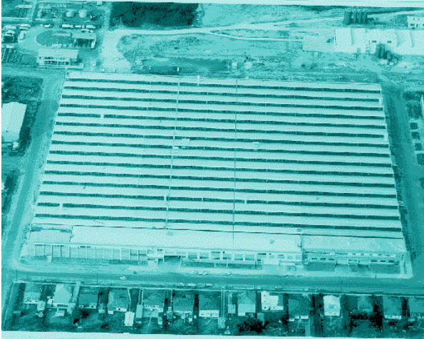
Woolworths Sydney Distribution Centre

Following this massive expansion the Glebe warehouse became too small and existing stock-handling methods too cumbersome. Beginning in 1960 a new eighteen-acre distribution centre at North Auburn (Silverwater) in NSW was built in stages. Occupying a whole block it provided the biggest building of its type in Australia with 800,000 sq ft of storage space on two levels. Variety stock was held on one floor with groceries and consumables on the other. The installation in the warehouse of 'Ramac', an electronic computer for modern stock control and distribution, established Woolworths as a leader in the use of computers in the retail industry. In 1962 on completion of the warehouse Sydprint moved from the Glebe warehouse to Silverwater and was renamed 'Woolprint' remaining there until 1989.