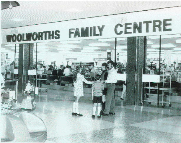
Family Centre, Indooroopilly QLD

On 27th November, at Booval, near Ipswich Qld, the Company opened a new BIG W Centre, which featured complete self-selection and checkout operation of department store merchandising as well as food – all on one 60,000 sq. ft. trading level. The following year a similar store opened at Indooroopilly, Brisbane. This was announced as a 'Woolworths Family Centre' and the Booval store then adopted the same name. At this time it was decided to suspend the trading name of BIG W Department Stores and transfer all of these existing stores to the new Woolworths Family Centre Division. By the end of 1970 another three Woolworths Family Centres were operating in Queensland, at Mt Isa, North Rockhampton and at Mt Gravatt (Brisbane).