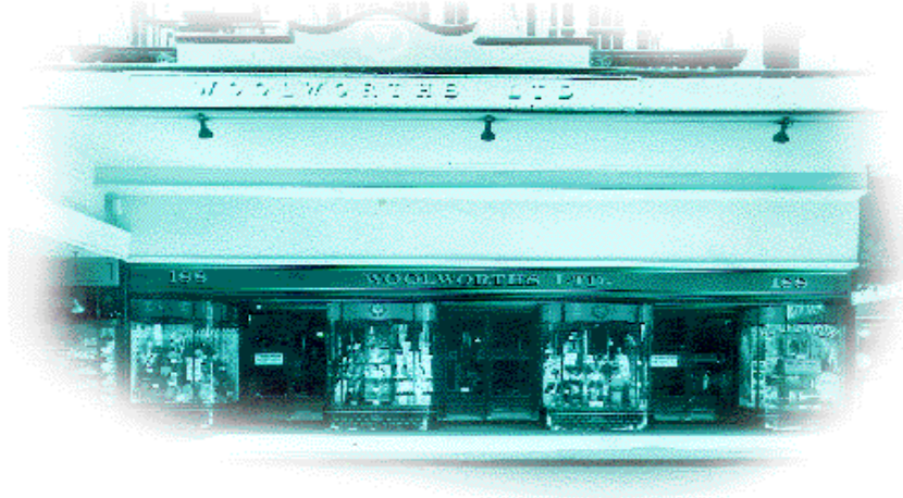
Woolworths Pitt & Market Streets store, 1934

Although 15,000 shares were offered to the public, there was little confidence in the venture. Only 11,707 shares were subscribed for by 29 people, mostly friends of the promoters. In spite of this it was decided to go ahead and open as soon as possible. The store was an immediate success and in its first year the Company paid a dividend of 5%, in the second year 40% and in the third 50%. The Founders' policy of selling goods in popular demand on a cash and carry basis had been vindicated.