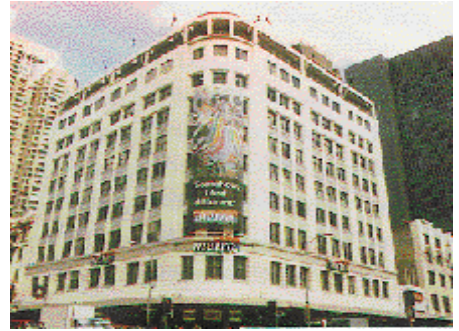
First Metro Store – Sydney NSW

In November, 1997, the Town Hall store in Sydney, Woolworths premier Variety store since its opening in 1965, had major refurbishment to convert it to the Company's first METRO store with the lower ground floor specialising in a large range of 'prepared meals' to cater for the increasing numbers of city dwellers.