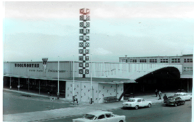
First Supermarket Warrawong

The first Woolworths supermarket opened at Warrawong, New South Wales in May, 1960 and was such a success that other store plans on the drawing board were reviewed to permit full development of all sites. During November and December of that year supermarkets were opened at Seven Hills, St. Ives, Berala and Fairfield Heights in New South Wales, Coorparoo and Margate in Queensland and at Elizabeth in South Australia. The acquisition of the 55-store Flemings food chain in June and the 57 New South Wales stores of McIlraiths in November further expanded the Company's food marketing.