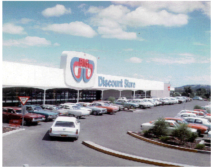
First BIG W Discount Store, Tamworth

1975 saw Australia in the grip of high inflation and the Company was beset by further heavy increases in wages. However 143 new stores were completed during the year and important policy discussions were held to rationalise trading operations and to plan the development of the BIG W Discount Store Division – a new style of retailing for Woolworths. The BIG W concept was for a large store, selling general merchandise on one level with extensive parking facilities. The first BIG W DISCOUNT STORE was opened at West Tamworth, New South Wales in 1976 and by the end of 1978, 13 BIG W Discount stores were operating with stores in all States and the ACT.