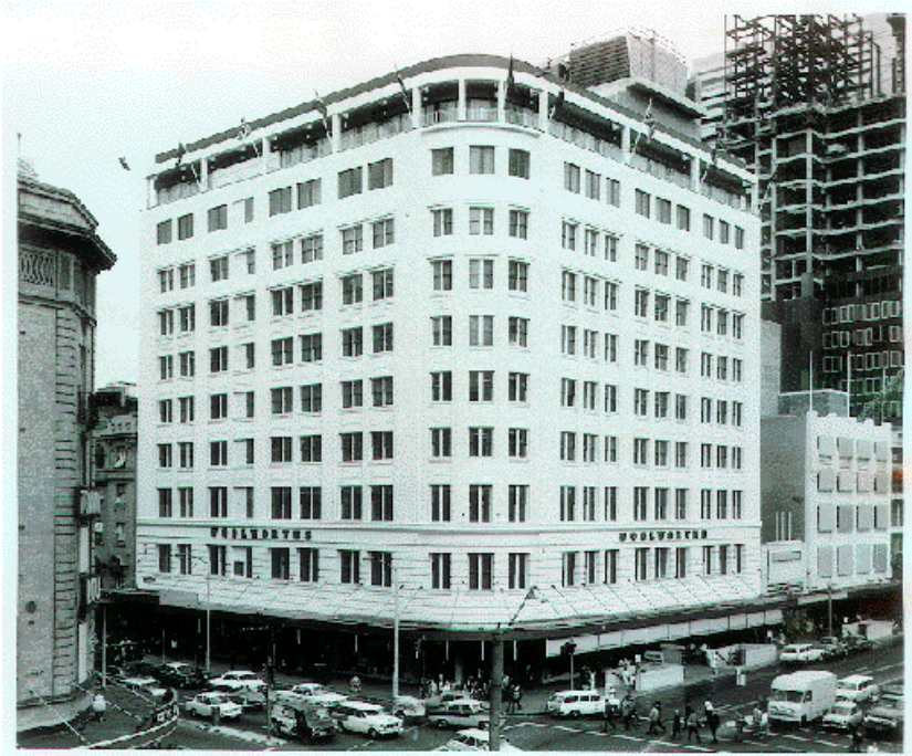
Town Hall Store & Head Office

One of the most significant events of 1965 was the September acquisition of the long-term lease of Bebarfalds Building, a famous Sydney landmark at the corner of George and Park Streets, opposite the Sydney Town Hall. The first stage of extensive alterations to the building (now known as Woolies Corner) culminated in the November opening of a 'new look' Woolworths variety store occupying the basement, ground and first floors. After the addition of two additional storeys, the upper floors became the Company's Head Office in March, 1967. Her Majesty's Store which had traded for 36 years closed in 1970 and the building was sold to the AMP Society for redevelopment as part of the Centrepoint project.