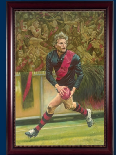
Previous works by artist Jamie Cooper

Presented on the highest quality fine art archival paper, each print will be signed by Anthony Koutoufides and the artist. The print is also protected by the asset security device, A-Tag, and each marked with a synthetic DNA sample to protect your investment.