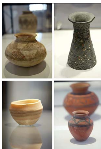
Artifacts discovered in Jiroft