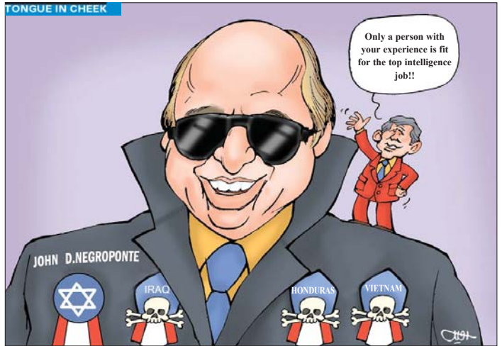
TONGUE IN CHEEK

Marashi said that the cabinet has also obliged the Ministry of Foreign Affairs to cede the buildings in the area to the ICHTO to implement the development project of Iran National Museum. Iran National Museum was established in 1937 by French architect Andre Gaudar.