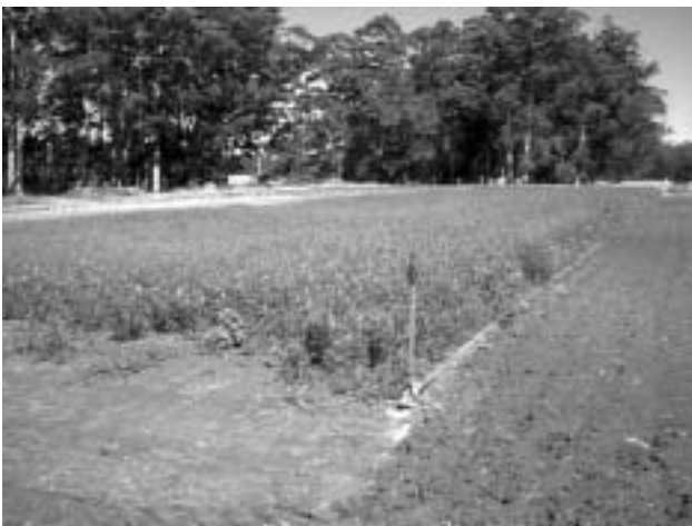
Oats and lupins green manure ready to plough under

A green manure crop generally consists of a mix of annual plants incorporated into the soil while green to improve soil properties and fertility. A dense, well established green manure crop can add organic matter, improve soil structure, soil fertility and give good weed control.