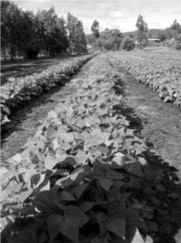
Organic bean crop under trickle irrigation