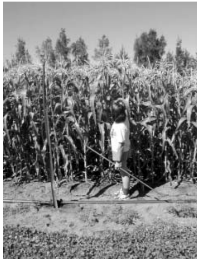
Organic sweet corn

Conservation and recycling of nutrients is a major feature of any organic farming system. Mineral fertilizers should be used as a supplement to recycling, not as a replacement.