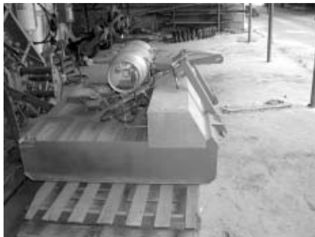
Gas powered flameweeding

Weed control methods prior to seeding typically begin with cultivations during soil preparation and bed-forming. Allowing a subsequent good weed germination, followed by a final shallow cultivation or flame weeding prior to sowing the crop, is very important. Flame weeding this flush of weeds can give effective control without disturbing the soil surface. This approach may reduce further weed germination by minimising the stimulating effect soil disturbance can have on new weed germination. Well-timed pre-emergent flame weeding can considerably lower subsequent weed control cost. After sowing and just prior to crop emergence, a flame weeder can be used again to give a weed free bed. Transplanted crops like cauliflower should be planted immediately after a final flame weed.