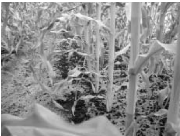
Sweet corn sidedressed with composted poultry manure

Acceptable sources include compost, dried blood, and a range of proprietary organic fertiliser brands such as Complete Organic, Organic 2000, Dynamic Lifter, Blood and Bone, Fish emulsion, and other protein sources. A number of these products can have a slower rate of soil mineralisation (plant availability) than many conventional sources of N, so during periods of rapid growth ensure sufficient N is available for balanced growth without causing excessive uptake. Excessive uptake is believed to increase plant susceptibility to pest and disease.