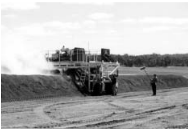
Large scale commercial compost production

Since materials in compost are in a stable form and their immediate availability can be low to moderate, timing of applications is important and may occur several weeks prior to cropping or during the green manure phase. Generally, compost does not provide a large source of immediately available nutrients, particularly nitrogen, although potassium and to a lesser extent phosphorous availability may be adequate depending on the compost quality.