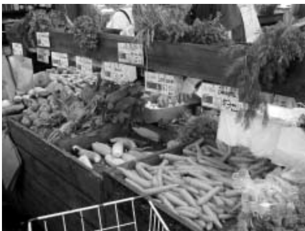
Organic speciality retailer - fresh produce display

Within the Western Australian market the specialty “health food” sector is the traditional and main current market. Sales volumes tend to be relatively small and while the number of stores offering organic fresh produce has increased, growth in sales volumes is likely to be limited.