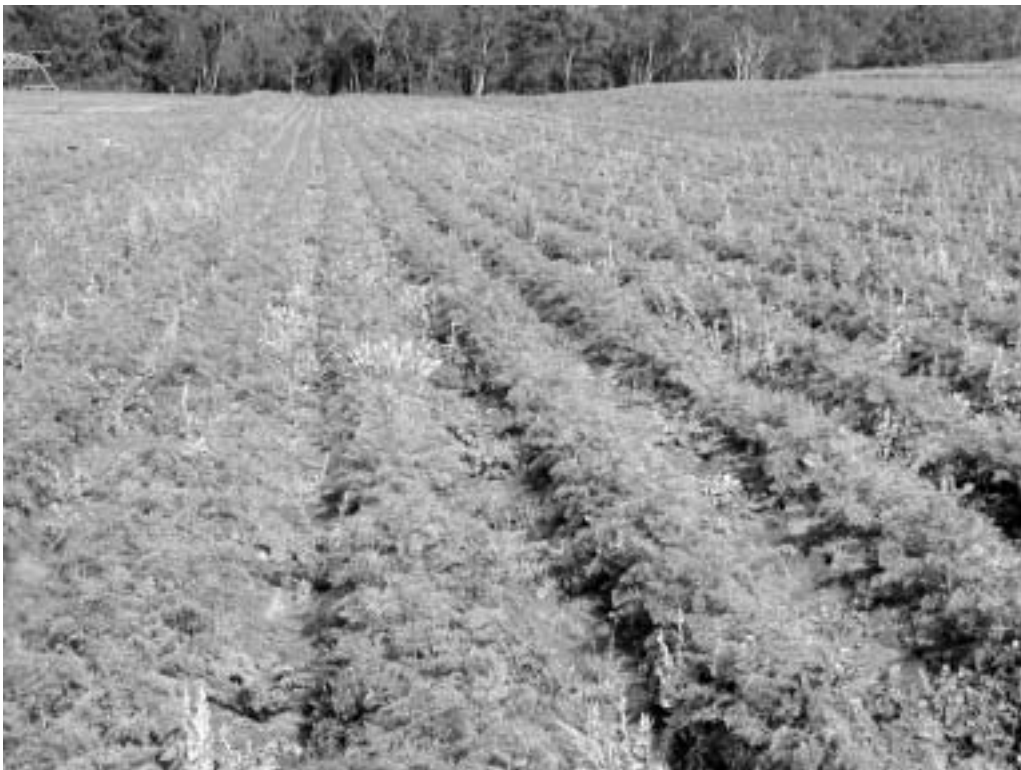
Economic control of weeds

Economic control of weeds must be determined on the basis of economic thresholds i.e. deciding what level of weed control expenditure will give optimal return rather than on the visual appeal of a totally weed free crop.