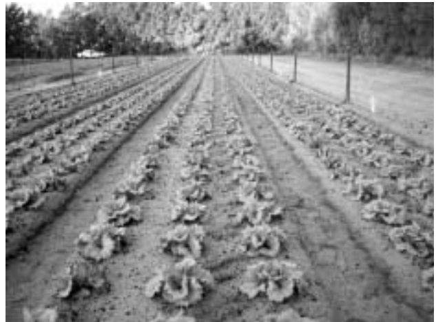
Shelter belts act as wind breaks and buffer from spraydrift

production. Chemical or heavy metal residue in soil must not exceed limits set by organic standards.