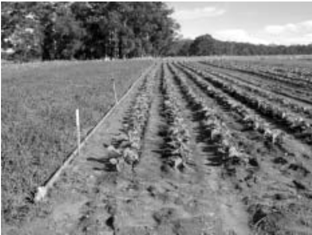
Cauliflower and green manure rotation

Wherever possible, a green manure crop, leguminous crop or a pasture ley phase should be included. Continuous cropping rotations without a pasture ley or green manure phase are generally not preferred, but may be acceptable only where soil fertility and structural characteristics are entirely met by importation of composted manures. However, the application of such inputs may be limited by some certification organisations to 20t/ha/year and/or the potential capacity of the land to produce such volumes of inputs.