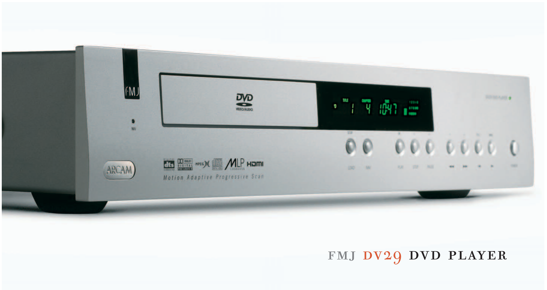
FMJ DV29 DVD PLAYER