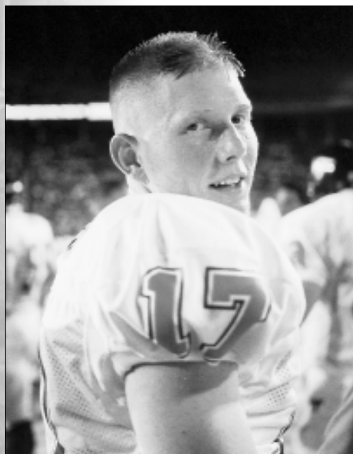
Place-kicker Shayne Graham is the BIG EAST Conference's all-time scoring leader.

Game 4 (tie) vs. Syracuse 10/1/94 (tie) vs. Pittsburgh 9/30/95 (tie) vs. SW Louisiana 11/2/97 (tie) vs. Virginia 11/28/98 Season 22 1998