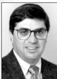
Michael Tranghese BIG EAST Commissioner