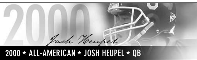
2000 ★ ALL-AMERICAN ★ JOSH HEUPEL ★ QB

The runner-up for the 2000 Heisman Trophy, Josh Heupel became Oklahoma's first consensus All-America quarterback and the first Sooner QB to earn All-America honors since Jack Mildren in 1971.