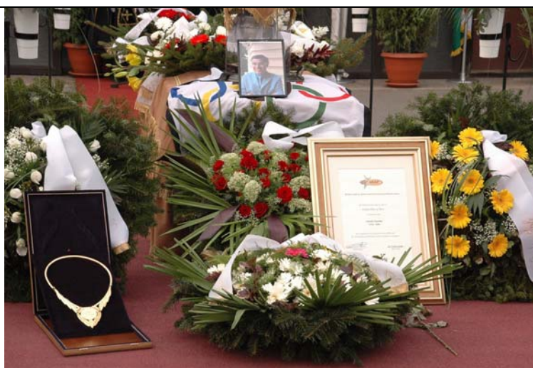
IAAF Golden Order of Merit displayed at the Funeral, 22 March 2006

The commemoration of Istvan Gyulai's life continued one week later on Wednesday 22 March 2006 in Budapest, Hungary, when a Mass was held at Szent Istvan Bazilika, which was followed by the Funeral at Pesterzsébeti Temető, at which on behalf of the IAAF, President Lamine Diack made the posthumous presentation of the IAAF's highest honour, the Golden Order of Merit.