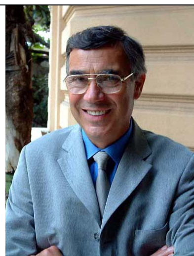
Istvan Gyulai (HUN)