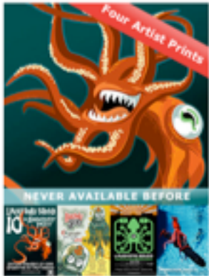
Laughing Squid Poster Set