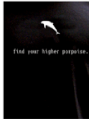
Citizen Agency Tees "find your higher porpoise"