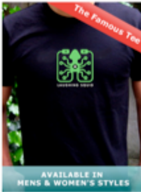
Laughing Squid T-Shirt, Stickers & Buttons