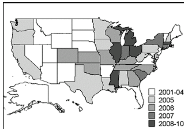
FIGURE 2: RETURN TO PEAK EMPLOYMENT (YEAR IN WHICH PRE-RECESSION JOB LEVEL HAS BEEN OR WILL BE RE-GAINED)

But labor markets have not improved uniformly across the country. Recovery has become harder--we project that only 18 more metros will regain 2000 employment levels in 2006. The small number is not insignificant, however, as it includes some of the nation's largest: Atlanta, Dallas-Fort Worth, Kansas City, New York, Seattle, and St. Louis are all expected to return to pre-recessionary job totals this year. That will still leave 99 metros, or 27% of the total, with payrolls yet to recover, including Boston, Denver, and San Francisco—which took a major hit after the burst of the high-tech bubble--and Midwestern, manufacturing-heavy, metros such as Chicago, Cleveland, Detroit, and Pittsburgh. Figure 2 illustrates the recovery status across the states. At the end of 2005 payroll employment levels in 18 states were lower than in 2000 1 . At the end of the decade three states, Michigan, Mississippi, and Massachusetts will have yet to regain their lost jobs. Appendix Table 11 details the metro experience.