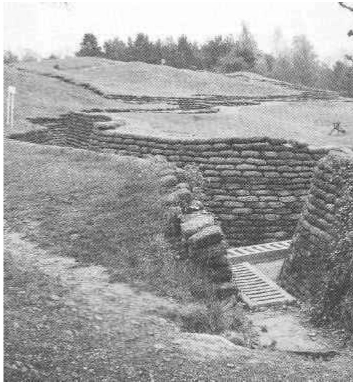
Remnants of the Canadian Outpost Line, now preserved with concrete sandbags.

assault, never more than 800 yards deep in any battalion sector, it was uphill all the way. No one doubted the enormity of the task facing 4th Division. Therefore any interference coming from the Pimple would greatly jeopardize the division's chances of success. To ensure its total neutralization before the attack, a second deep mine was planned to destroy an adjacent and mutually supporting enemy