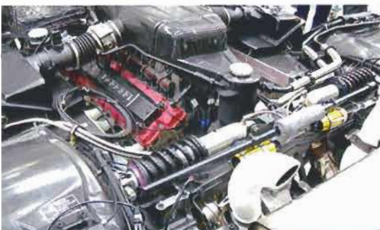
Enzo V12 is used, but lighter P4/5's top speed has risen to 225mph

P4/5's curves are inspired by Sixties Le Mans racer