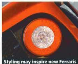
Styling may inspire new Ferraris

UNLIKE many one-off sports cars, the P4/5 isn't going to spend its life sitting in a garage or museum. It's designed for road use and has even been fully crash tested – on computer.