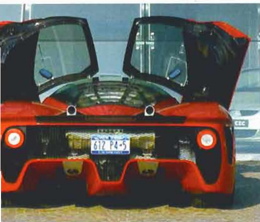
g doors come from Enzo, while rear exposes car's running gear