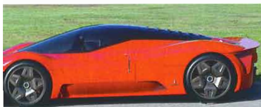
bodywork has been wind-tunnel tested for stability at speed

incorporates a pair of gullwing doors. At the front, the Enzo's twin radiators have been replaced by a single unit to allow a shorter nose more in keeping with the P4 of the Sixties. In contrast, the LED headlamps and tail-lights, intricate 20-inch alloys and complex reprofiled venturi tunnels which help to provide downforce are bang up-to-date.