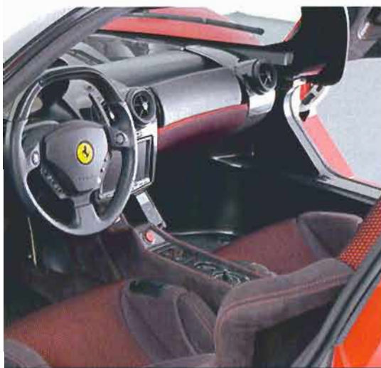
built cabin is fitted with bespoke materials and hi-tech gadgets