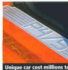
Unique car cost millions to