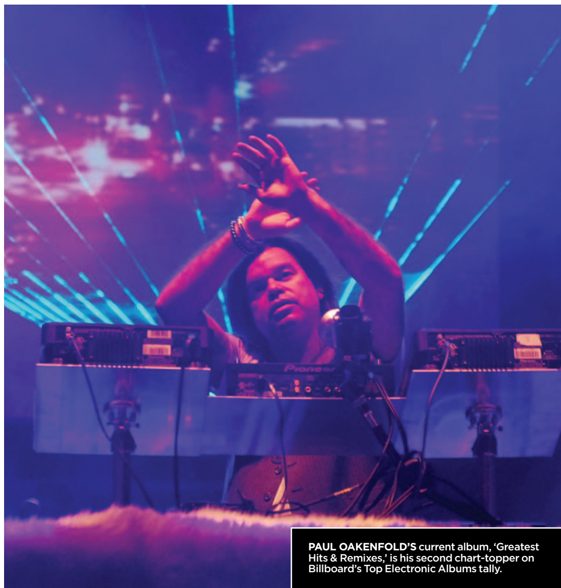
PAUL OAKENFOLD'S current album, 'Greatest Hits & Remixes,' is his second chart-topper on Billboard's Top Electronic Albums tally.