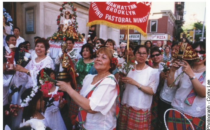
Carmine Street in Manhattan