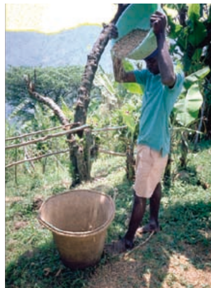
A villager around tea and sugar plantations in northern Uganda.

What the ILO is doing– The ILO provides advisory services on policy development and workplace mobilization, arranges training to develop the competencies and structures that sustain HIV awareness in the workplace, and supports the development of education materials addressing the HIV-related information needs and concerns of workers. These workplace interventions reduce stigma through policies, agreements and education to promote the principle of non-discrimination and encourage a supportive work environment and open discussion of HIV issues. The ILO works with private enterprises to ensure the availability of free services such as voluntary counselling and testing, care to prevent the transmission of HIV from mother-to-child, and condom availability for workers and for members of the surrounding communities. As a result, workers in locations such as the Uganda tea and sugar plantations are increasingly accessing counselling and testing services and medical support and care, including antiretroviral therapy.