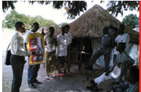
Peer educators doing awareness at a bus stop in Luau market, in returnee areas in Angola.

In Zambia, UNHCR conducted behavioral surveillance surveys among Congolese refugees, again with the support of Merck. The result of the survey has helped UNHCR to better target HIV programmes for refugees in Zambia, and to plan for programmes in areas of return in the Democratic Republic of the Congo. In Namibia, Merck support has allowed UNHCR and its partners to keep pace with developments in the national HIV response, including upgrading and integrating voluntary counselling and testing and prevention of mother-to-child transmission programmes in Osire refugee camp.