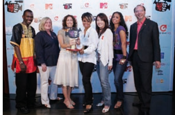
Judges and award winner of the MTV 48Fest film competition themed around AIDS.

What accounts for the disconnect, and how can it be overcome? Part of the problem may be found in the messages and approach of some HIV education efforts. Studies consistently show that prevention programmes that lecture or attempt to frighten young people are ineffective. Staying Alive takes another approach, one that focuses on informing and involving young people.