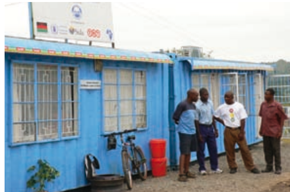
The Muyende Bwino wellness centre in Malawi.

The wellness centres are truly multipartner, multisector collaborations. GDC Whelson, the largest transport company in Malawi, donated the shipping containers that house the facilities; the Government of Malawi provided the location and supplies the basic drugs free of charge. The centres are operated by local nongovernmental organization Banja La Mtsogolo (BLM) which, along with UNFPA, provide condoms; the international nongovernmental organization PSI provides educational materials; and the Malawi Business Coalition Against HIV/AIDS and the Malawi Road Transport Operators Association promote the services among their members.