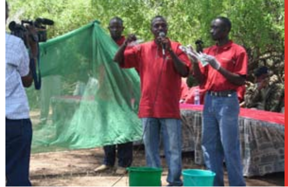
Serena Hotels' wellness educators explain to the local communities at Samburu Serena Safari Lodge how to treat a mosquito bed net, Kenya.

IFC provided training in programme monitoring and evaluation; provided seed funding to support the implementation, monitoring and evaluation of Serena's HIV activities; and through a collaborative