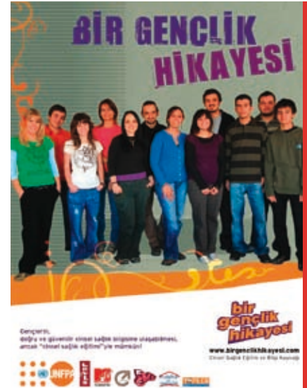
The campaign's poster.

Campaign trainings help young people become effective advocates for their own education and for the information needs of their peers. Advocacy workshops reflecting key campaign messages bring together young participants from 30 provinces in Turkey. Trainees then act as advocates for other young people, reaching out to peers and creating networks of awareness on SRH. Furthermore, trainees act as advocates for young people's information needs and SRH rights with local policy and decision-makers. So far, 70 young people have been trained as key advocates. In the first six months, the campaign joined youth events at 30 university spring festivals, three international music festivals and two national youth festivals.