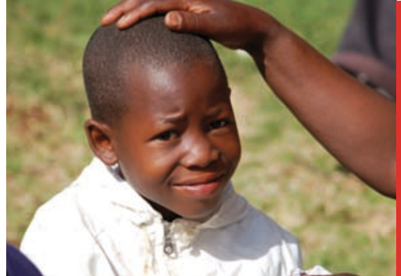
A child orphaned by AIDS in Lesotho.

Since 2001, the Kimberly-Clark Corporation, home to some of the world's most recognized brands, has provided US$ 5.2 million to increase UNICEF's (United Nations Children Fund) capacity to deliver programmes that provide life-saving supplies, health care, nutrition, education and income-generation skills to give vulnerable orphans a chance for a better future. Kimberly-Clark has, in fact, been the largest supporter of UNICEF programmes to protect and care for children orphaned and made vulnerable by AIDS, and their funding has helped to leverage an additional US$ 10 million from United States donors through challenge match mailings. In 2006, this partnership earned Kimberly-Clark a United States Chamber of Commerce Corporate Citizenship award in the International Community Service category.