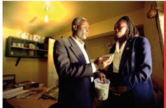
Health worker distributing ARV drugs to a support group for people living with HIV in Africa.

Addressing the myriad challenges of drug and diagnostic procurement requires a multifocal response. WHO trained regional consultants to support countries in preparing, revising and implementing Procurement and Supply Management (PSM) plans; developed workplans to strengthen their national PSM systems and address the main PSM problems confronted by each country. Partners in this effort included the Global Fund, several UN agencies and different departments and offices of WHO.