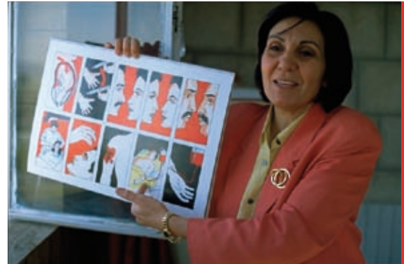
AIDS prevention materials produced by UN agencies and local nongovernmental organizations in the Middle East.

Seeking practical tools to engage the Egyptian business community in the AIDS response, the United Nations Office on Drugs and Crime (UNODC) joined Egypt's National AIDS Programme, other UN partners (notably UNAIDS, UNICEF and ILO) and the nongovernmental organization CARE in a task force to produce the Egyptian Partnership Menu, a tool to link private sector companies with innovative AIDS partnership opportunities. Produced in English and Arabic and disseminated to businesses throughout Egypt, the menu provides potential donors with an illustrative list of AIDS projects that they can sponsor at the national level and concrete examples of results that can be achieved with their support. The menu is the first of its kind in the Middle and North Africa region.