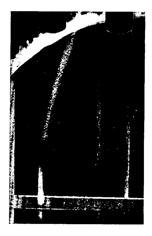
Figure 3: Track B .