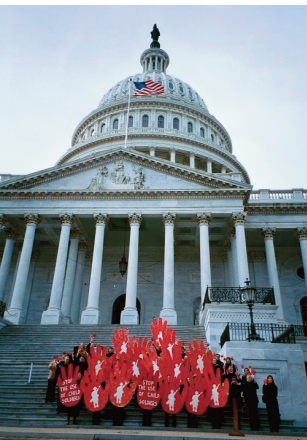
Members of the US Campaign to Stop the Use of Child Soldiers display red hands on the steps of the US Capitol building.

The aim of this global campaign is to present UN officials in New York with one million red hands on Red Hand Day 2009 (February 12), the anniversary of the day the treaty to ban child soldiers took effect. We will make clear that we expect more than a ban – we want it to be enforced.