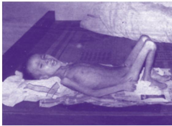
As an example of fear-based messaging, the press reported that this boy was deliberately injected with blood contaminated with HIV by someone seeking revenge against his father.

The focus, both in public health campaigns and the media, on negative images of sick, dying, and disfigured persons; the sensationalization of alleged cases of vindictive and purposeful infection of others by people living with HIV and AIDS (for example by injecting their blood into others or having premeditated unprotected sex); and lack of positive images of the more prevalent reality of people with HIV and AIDS who are productive and responsible members of society ratchets up the fear and panic of