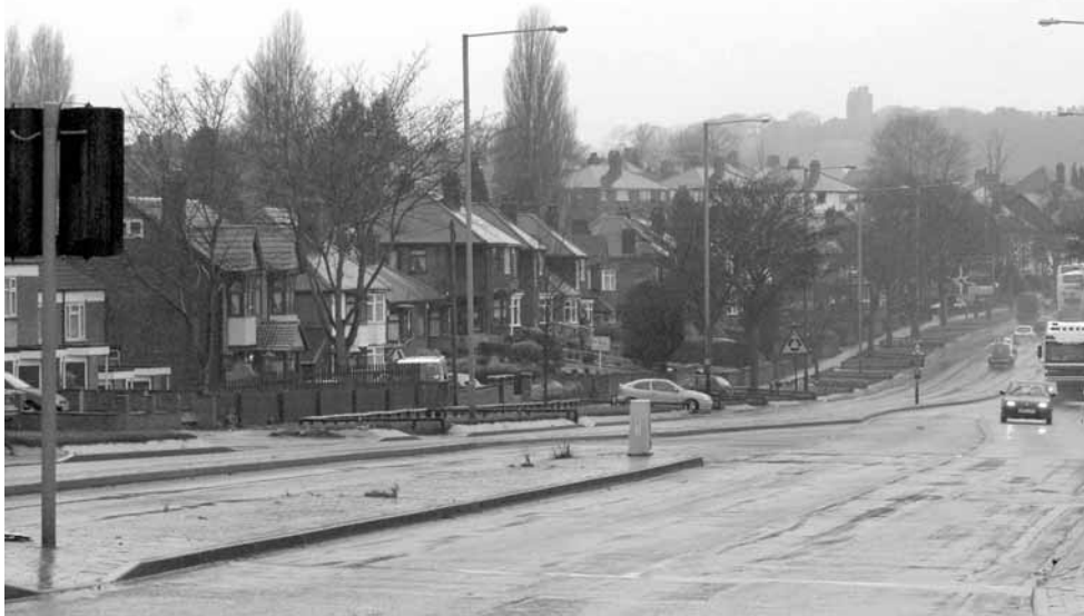
The many-named Birmingham-Wolverhampton New Road as it is today through Tividale

The route of the proposed road had been determined