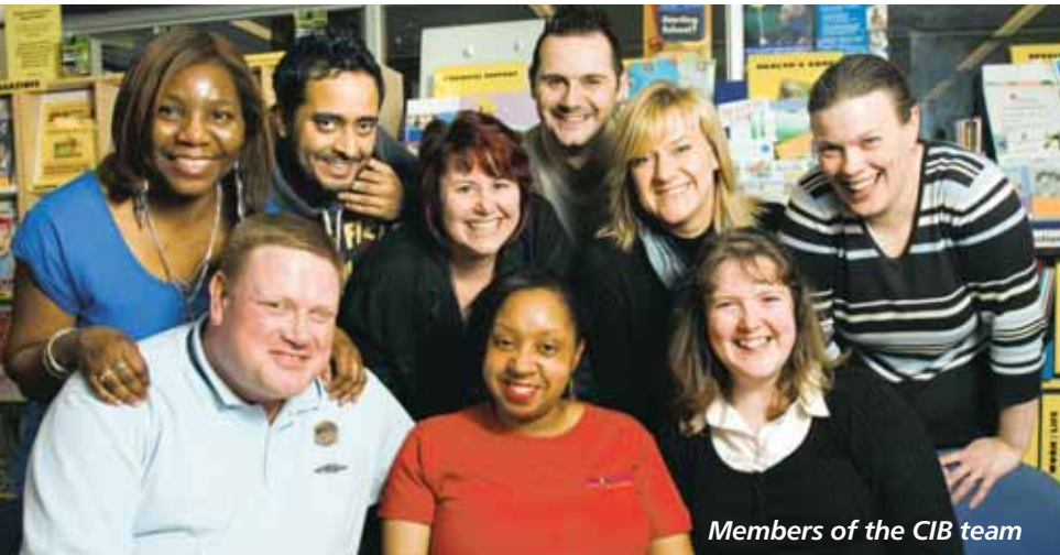
Members of the CIB team

The CIB team can also help if you are considering making childcare your career. The team has information on childcare courses available across the city and can offer advice for the best way to kick-start or further develop your career. But, it's not just about childcare! There is information on education, health, disability, safety, employment, leisure activities and much more. Visit the public access area at Central Library, Chamberlain Square and browse the extensive range of books, magazines and journals on every aspect of parenting. Here, Forward takes a look in more detail at what the CIB has to offer.