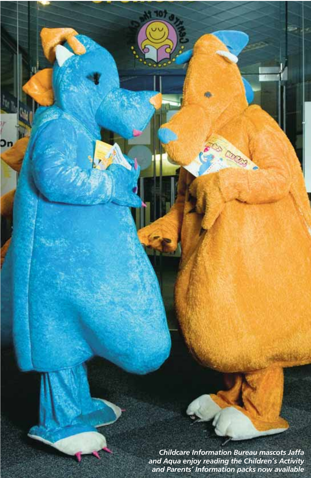
Childcare Information Bureau mascots Jaffa and Aqua enjoy reading the Children's Activity and Parents' Information packs now available