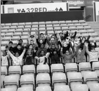
Enjoying a day out at Villa Park – above, St Augustine’s School and, below, Birchfield Community School