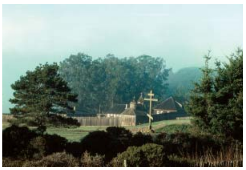
View from Russian Cemetery

This park is supported in part through a nonprofit organization. For more information contact: Fort Ross Interpretive Association, Inc. 19005 Coast Highway One Jenner, CA 95450 (707) 847-3437