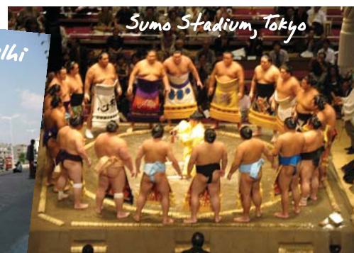
Sumo Stadium, Tokyo