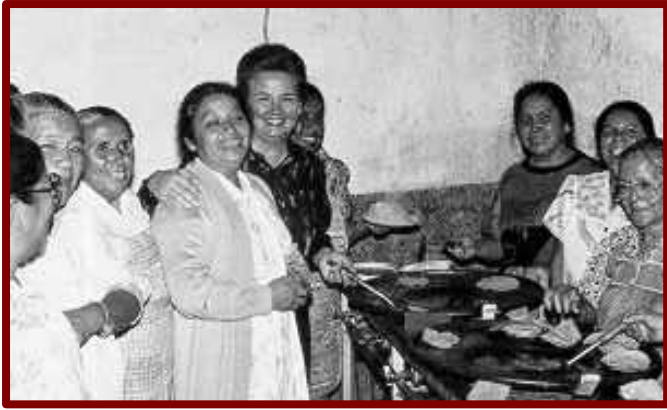
The sisters were surprised to learn that I was no novice at preparing Mexican food.

Through the pages of this JOURNAL, I would like to introduce you to some new-found members of our universal family.