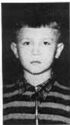
The Lord showed Brother Branham that this boy would live also.