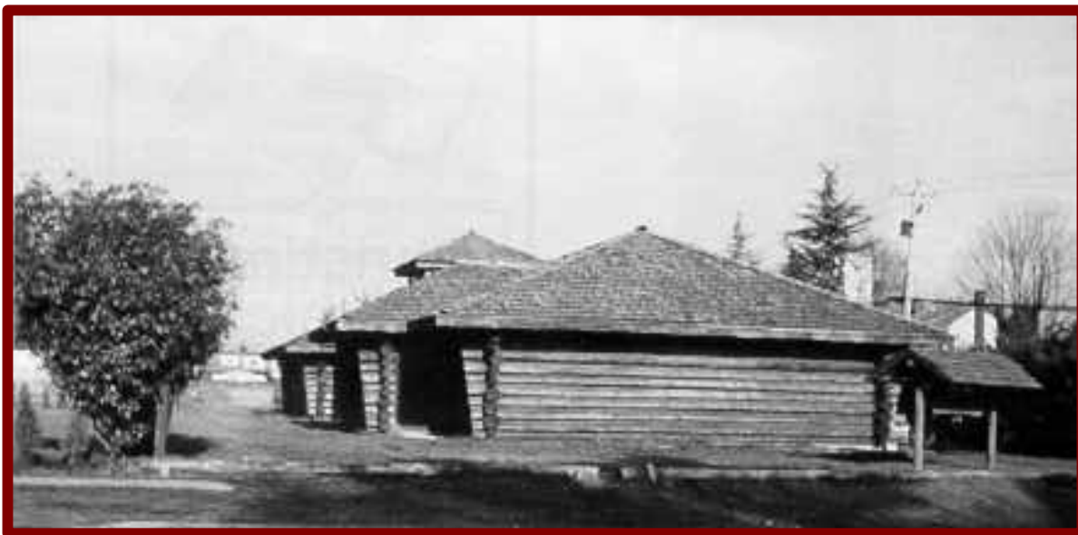
By Ruth Byskal

Through the Bible Believers’ Broadcast, multitudes of people heard the prophet’s voice, in their homes, hospitals, places of business, vehicles, and even in jungle villages. Two of the stations carrying the broadcast were the powerful 100,000 watt “Swazi Radio” in South Africa, which covered an area inhabited by 87 million people, and the 50,000 watt WWL in New Orleans.