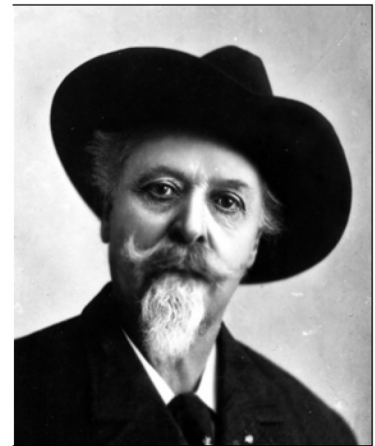
"Buffalo Bill" Cody

George Parker, alias Butch Cassidy Esther Hobart Morris Battleship USS Wyoming Historic Governors' Mansion Oregon Trail Wagon Ruts Grand Teton National Park