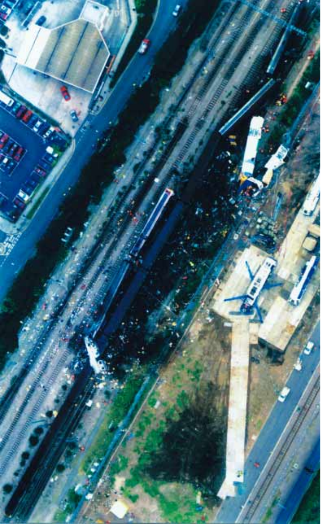
Plate 16: Aerial view of crash site taken on 7 October 1999.