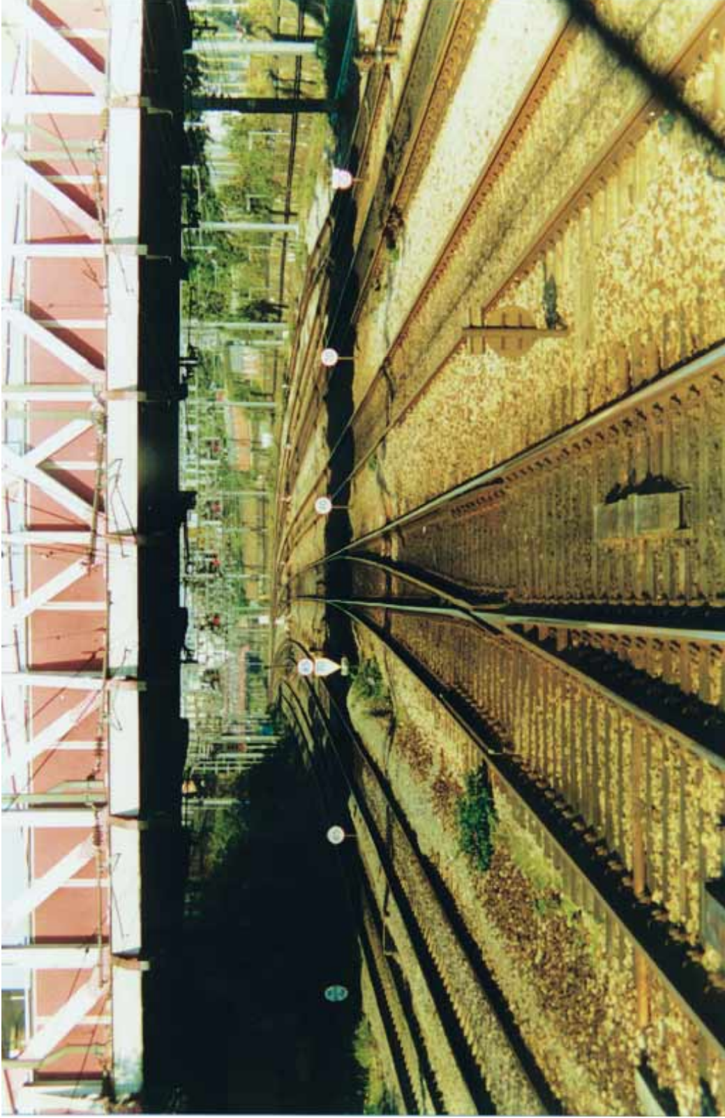
Plate 4: Gantry 8 at a distance of 168 metres. Taken from the driver's position in a Class 165 Turbo on Line 3.