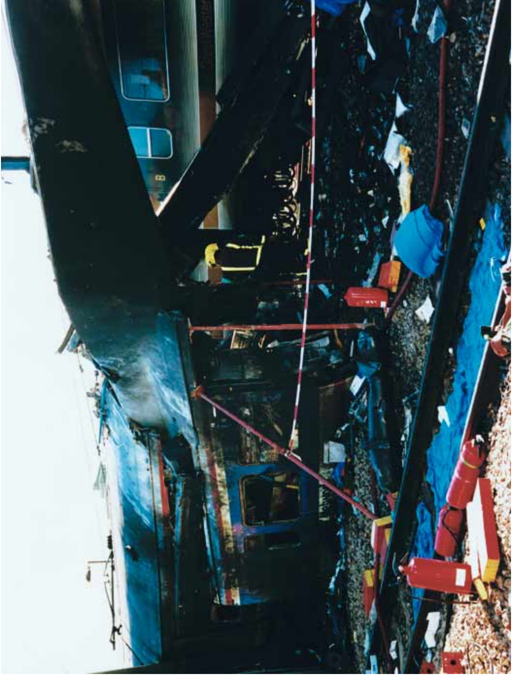
Plate 8: Front and middle cars of the Thames Turbo: view from the north.