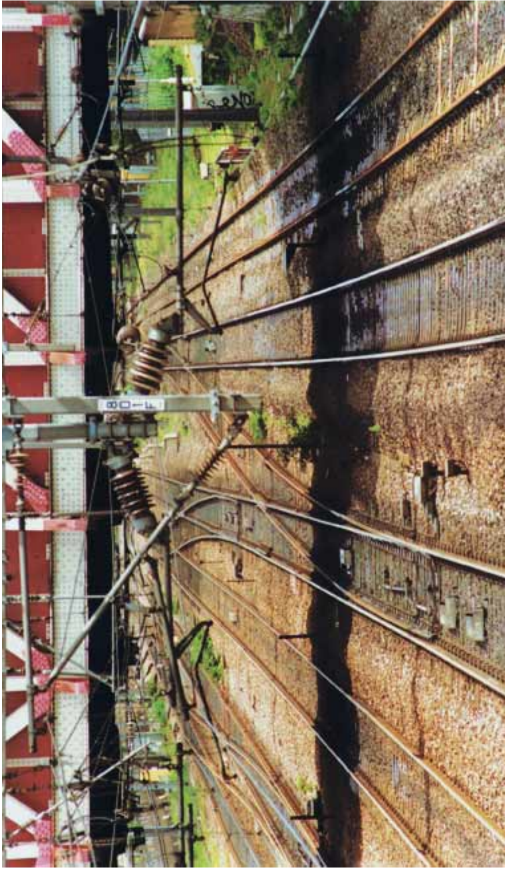
Plate 14: View towards Paddington. Taken from Gantry 8 with the camera placed directly above the red aspect of SN109. The lines are numbered 1 to 6 from right to left. SN109 applies to Line 3.