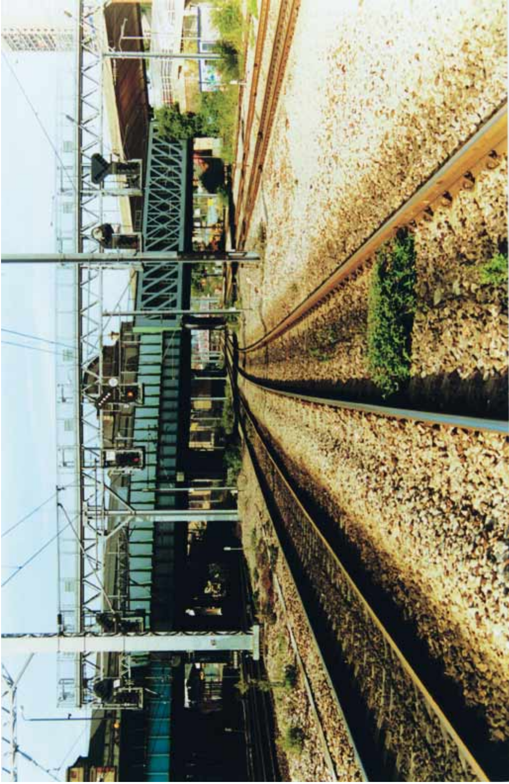
Plate 1: Gantry 6 showing, from left to right, signals SN81, SN83, SN85, SN87, SN89 and SN91. Taken from ground level on Line 4, to which SN87 applies.