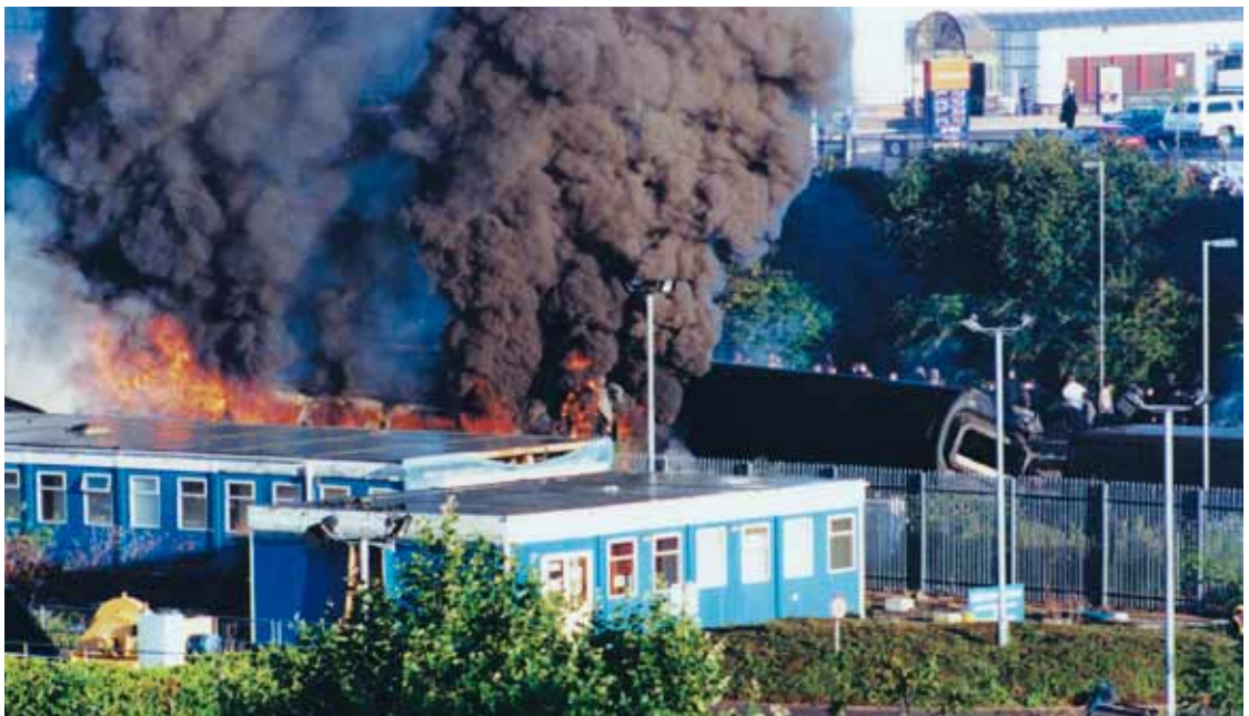
Plate 10: Later stage of the fire in coach H of the HST: view from the south.