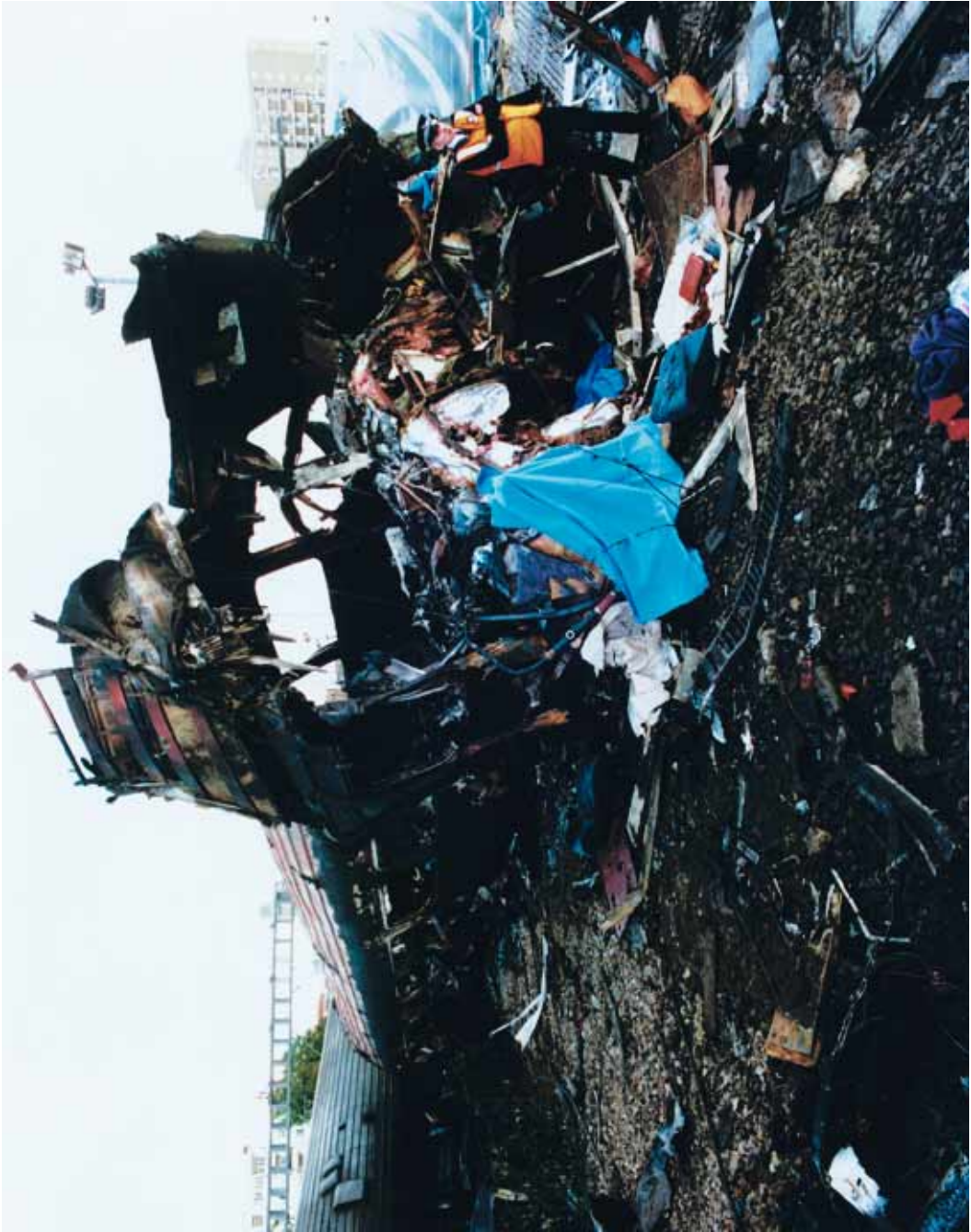
Plate 13: Coach H of the HST: view from the west.