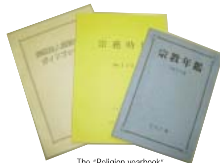
The “Religion yearbook” and other publications

In addition to collecting statistical data concerning religion, the Agency for Cultural Affairs also compiles and publishes the annual “Religion Yearbook” and other publications.