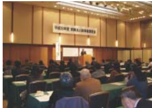
A lecture for leaders of religious juridical persons

In addition, as regards so-called inactive religious juridical persons, the Agency promotes the resolution of their inactive state through merger and dismissal.