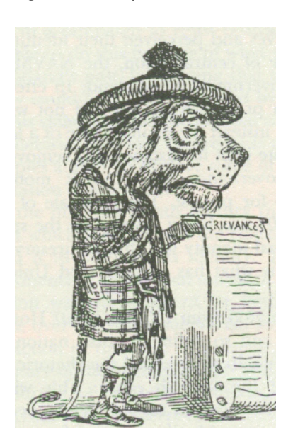
Figure 7: The sad Scottish lion lists its grievances

Scottish grievances, is a good example. 303