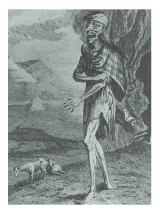
Figure 2: Scotland as poverty

Another central element in shaping Scottish identity throughout the eighteenth and early nineteenth century was anti-Scots feelings of the English, which partly developed as a result of the Jacobite rebellions. These feelings were based primarily on stereotypes similar to those we have heard about before: Scotland remained the 'poor relation' in contemporary caricatures. One good example is a propaganda painting by John Wilkes, one of the most famous anti-Scottish Englishman from 1763 <sup>117</sup> which shows a very thin looking Scot (the beggar) dressed in tartan rags: