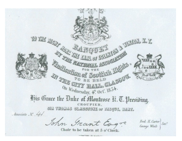
Figure 6: An invitation rich in symbols

Forms of banal nationalism can be used to revive the national spirit in times when, in general, people were content with their life. This was very much the case in mid-nineteenth century Scotland when the opportunities of the Empire and the virtual autonomous self-government had secured middle class power and were beneficial for the Scots. Heraldic emblems, flags in particular, and the related heraldic rhetoric were used by the Association to remind all Scots of their nationality and that they should fight for their rights as Scots within the Union. Accordingly, the Association was keen on using national symbols for that very purpose to visualise the distinctiveness of the Scottish nation and identity, of Scotland's ethnie . A good example is the following invitation for a banquet<sup>288</sup> on which we can, for example, see the Scottish Unicorn: