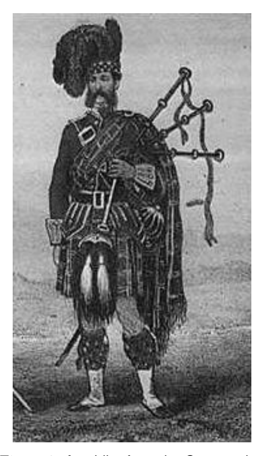
Figure 3: A soldier from the Cameronians

Scottish soldiers in the British army was relatively low compared to Scotland's population, says MacKenzie, "they were everywhere in the visual record." The following picture of a soldier from the Cameronian regiment in India is a good example. 201