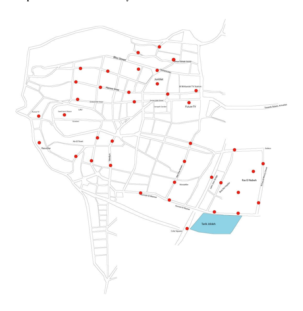
Map 1: Clashes in Beirut on 8 May 2008

For a better resolution, <lebsecurity.blogspot.com/>