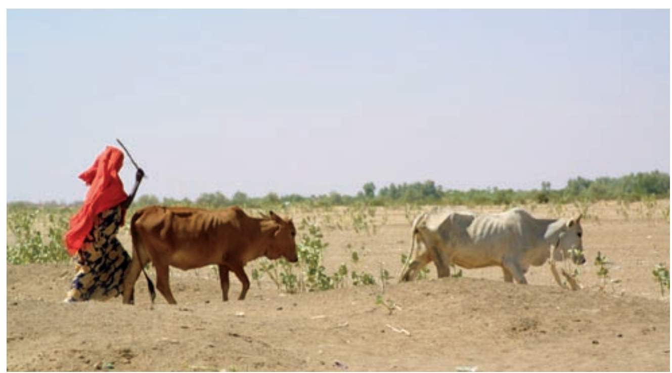
USAID is working to help African herdsmen, such as this woman driving cattle near Zeway, Ethiopia, to sustain their livelihood.

In Ethiopia, an innovative collaboration between a U.S. government foreign aid agency and nongovernmental organizations has allowed herdsmen not only to survive drought but also to rebuild their lives.