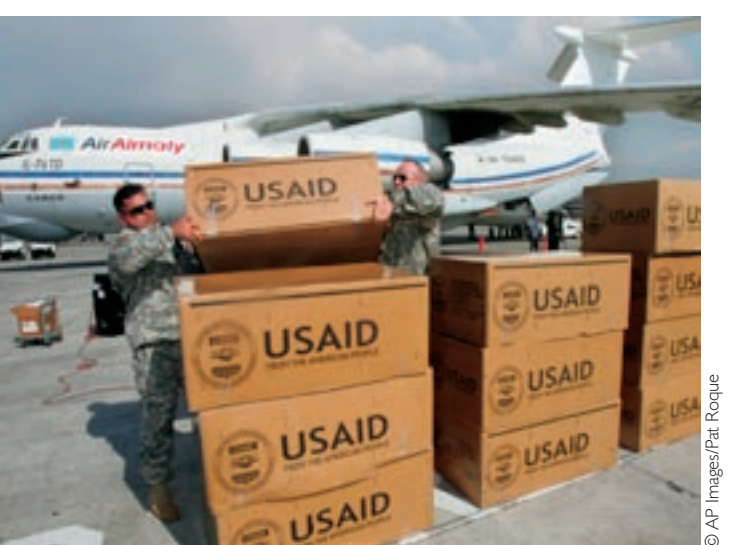
Congress is deciding whether U.S. food aid will consist entirely of U.S. -produced commodities or whether some part of the food could be purchased from foreign producers closer to a site of emergency.

The version of the 2007 farm bill passed by the House of Representatives by a vote of 222 to 202 in July would leave the existing program unchanged. House members did not raise the issue during full House