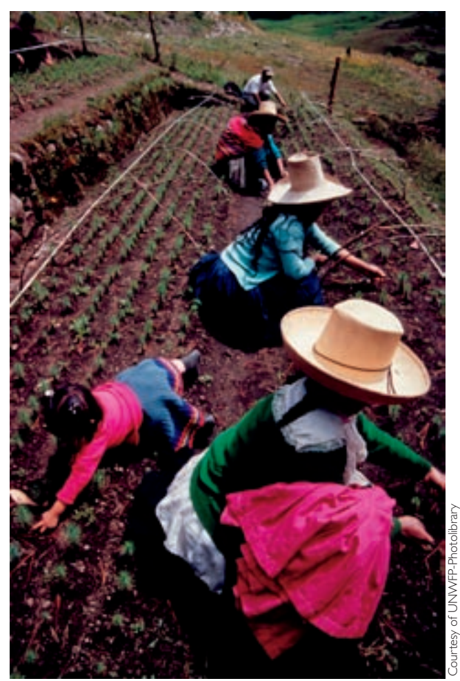
Women in Cajamarca, in Peru's northern Andes, tend crops at their community field as part of WFP's food-for-work activities.

Q: What are the political obstacles to conquering world hunger?