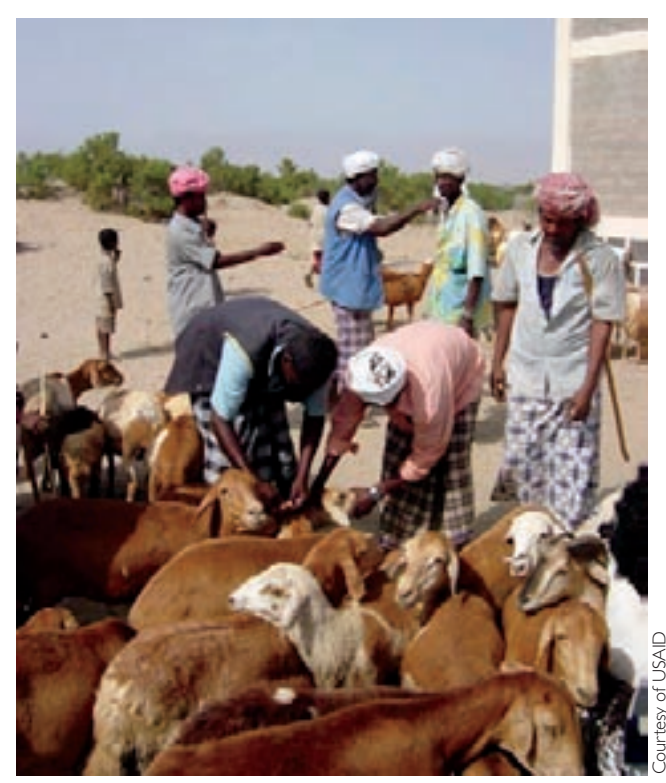
Across the Horn of Africa, goat herders and other pastoralists need money and technical expertise.

Building on the success of these activities, USAID encouraged Ethiopia's Ministry of Agriculture and Rural Development to form a Livestock Policy Forum. Five working groups have been building government policy on emergency de-stocking, emergency animal health care, emergency fodder provision, restocking, and natural resource management. One result already: Ethiopia's government has agreed to make concessionary loans to traders to purchase livestock in an emergency.