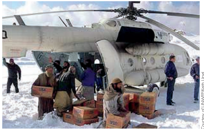
The United Nations World Food Program works quickly delivering food in emergencies such as the 2005 earthquake in Pakistan.

nongovernmental organizations (NGOs) that deliver food aid abroad and to anti-hunger advocacy groups such as Bread for the World.