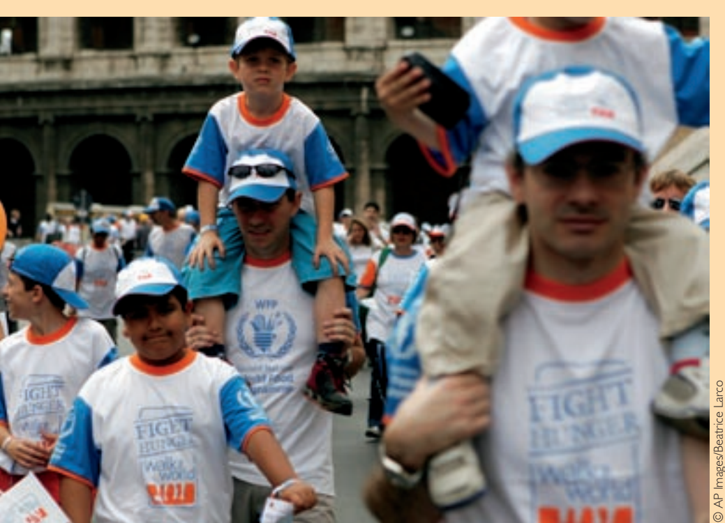
Participants in the World Food Program's "Walk the World" global march against hunger in Rome in 2005. Proceeds raised by the annual event go to the WFP's Global School Feeding Program, which provides free school meals to millions of children in developing countries.

The WFP, which is based in Rome, distributes food assistance to nearly 88 million people, with about one-third of that going to development projects and the remaining two-thirds going to emergencies and relief and recovery operations. The WFP works with multilateral and bilateral groups, individual countries, corporations, and foundations to collect and distribute food and other commodities.