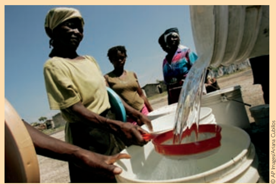
In Haiti, these women get clean water courtesy of the Food and Agriculture Organization, one of the United Nations agencies providing food aid.

More than half of the world's food aid comes from the United States. Getting food from U.S. farms to food aid recipients in the developing world can be a daunting and controversial task. Pulling off the complicated journey from fields to feeding centers calls into play a number of disparate players, including international bodies, national legislatures, the agriculture industry and its lobbyists, nongovernmental organizations, and advocacy groups. And only a few major organizations provide guidance on the process. Who is involved and what laws and initiatives govern how the food is distributed?