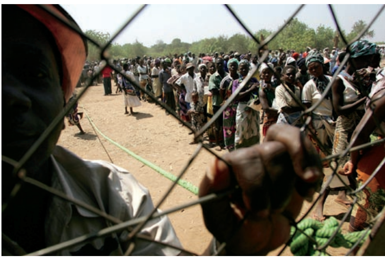
People wait for maize at a distribution point in Sanje, Malawi, one of the countries hit hardest by the HIV/AIDS epidemic.