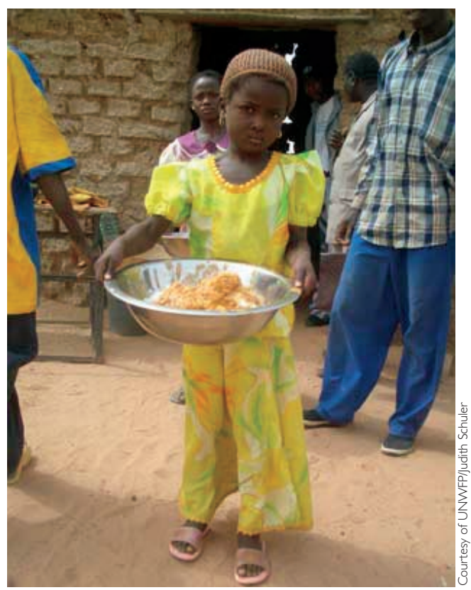
A girl at the Tambeye Nomad School in Niger receives from WFP the nutrition she needs to learn.

Today, we still lose a child to hunger every five seconds — an unacceptable toll. Yet we are now at a point in history where we have the science and technology to feed everyone on Earth. I hope both to raise awareness of how that can be accomplished and to give profound thanks to the citizens of the many countries that contribute so much in the fight against hunger.