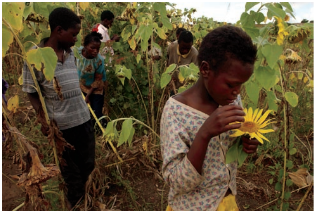
Children in Chimoio, Mozambique, learn agricultural techniques at one of the Junior Farmer Field and Life Schools, a program operated by U.N. agencies in six countries.

make a tremendous difference, helping people survive longer, keeping children in school and off the streets, and helping families stay together. It is an idea that is finally catching on.