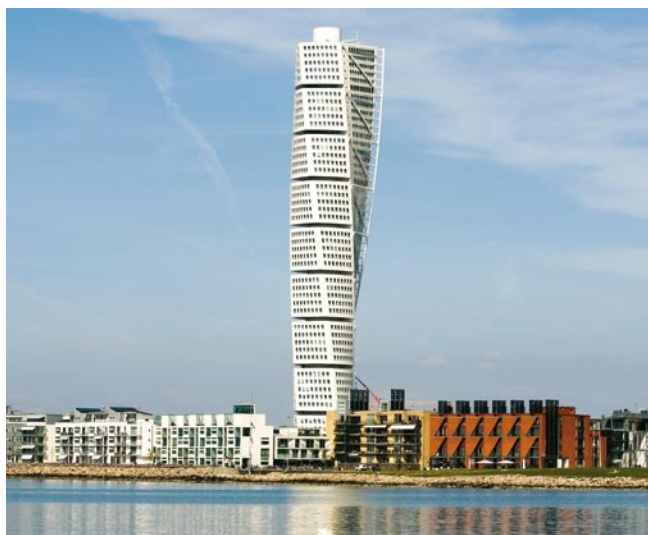
HSB Turning Torso Meetings.

The qualifiers have been played and now we know the 14 teams that will take part in the play-offs on 11–15 October for the seven places available alongside Sweden at the 2009 UEFA European Under-21 Championship.