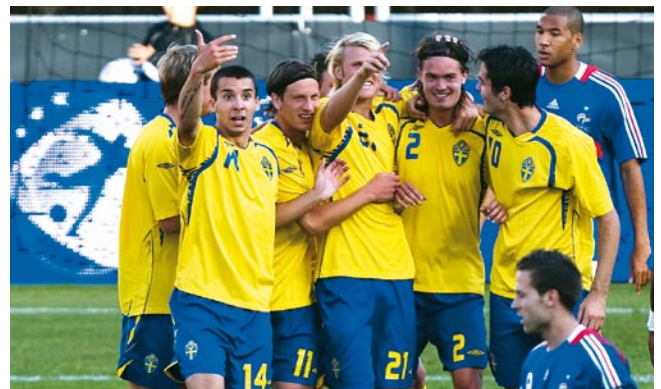
Happy Swedish players after a goal against France in the tournament in Sweden in June.