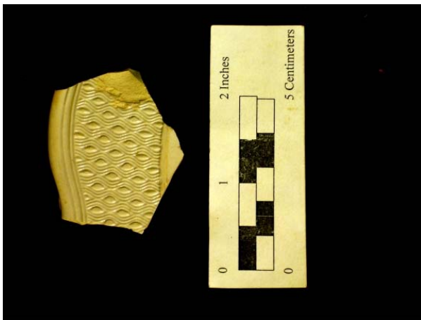
18th century white salt glazed stoneware.