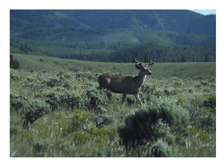
Global warming will significantly alter alpine habitats throughout the Intermountain West, which are home to many wildlife species, including mountain goats, bighorn sheep, elk and ptarmigan.

High-elevation species are particularly vulnerable to global warming given the fact that they have limited space available to find new habitats as higher temperatures push them farther up in the mountains. In some places, further warming could squeeze out some species and habitats altogether. For example, according to a new report by the Rocky Mountain Climate Organization and Natural Resources