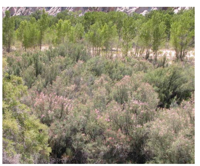
Global warming will contribute to the expansion of invasive species such as Tamarisk, shown here in the Grand Staircase Escalante National Monument in Utah.

One such species is the Tamarix shrub, a plant that was introduced in the 16<sup>th</sup> century as an ornamental shrub and windbreak and has since spread rapidly into perennial riparian drainages throughout arid and semi-arid regions in the West. Tamarix consumes a lot of water, and can reduce water availability and dry out ponds and streams in the riparian regions it invades. It also does not provide good habitat for many native wildlife species because it lacks palatable seeds, harbors few insects, and forms dense stands which destroy native habitats. Projected increases in average temperatures and a decline in annual precipitation