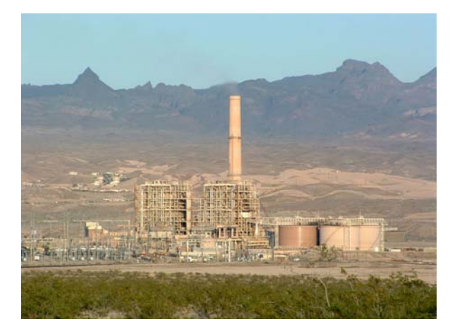
Placing mandatory limits on carbon dioxide emissions from coalfired power plants and other major sources is the best way to channel the ingenuity of America's industry to confront global warming.

To meet that deadline, America must show leadership and take decisive action right away. The United States is historically and currently the single greatest contributor to global warming, and U.S. emissions alone are expected to grow 13 percent over the