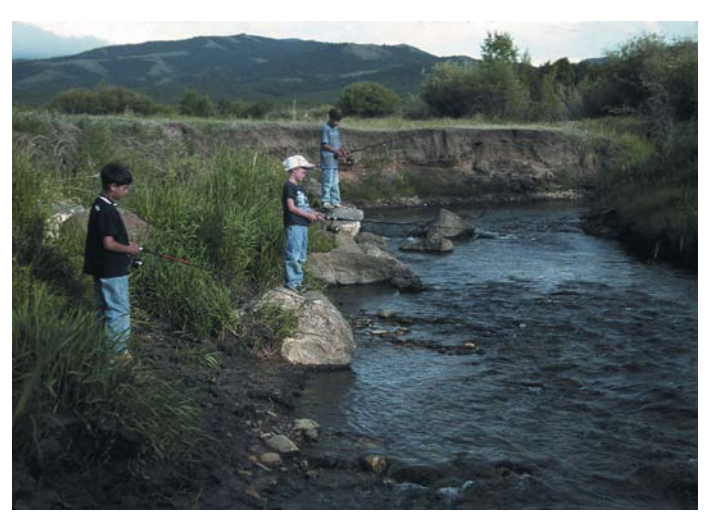
Hunting, fishing and other outdoor traditions are an important part of life in the American West.

Above all, burning coal, oil and gas is the driving force behind global warming, which will dramatically alter the western landscape if left unchecked. Indeed, the growing body of