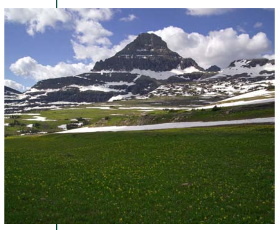
Winter snowpack accounts for 75 percent of the water supply in the west and is the primary source of water in many areas in summer.

One of the greatest concerns about global warming in the West is the impact on the region's water resources. Winter snowpack accounts for 75 percent of the water supply in the West and is the primary