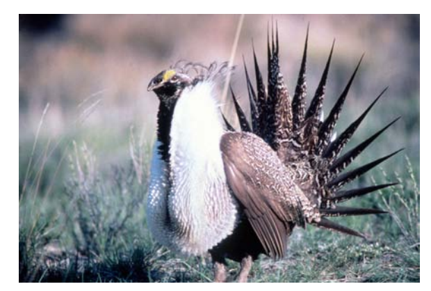
Extensive oil and gas drilling has been identified as a major factor in the decline of sage grouse populations in parts of the West.

Within the past decade, energy companies have proposed and begun projects to drill on millions of additional acres in the West that provide essential habitat for fish and wildlife, facilitated in part by recent federal government efforts to reduce important environmental protections. According to the U.S. General Accounting Office, the total number of permits approved by the Bureau of Land Management for drilling on public lands tripled (from 1,803 to 6,399) between fiscal years 1999-2004,