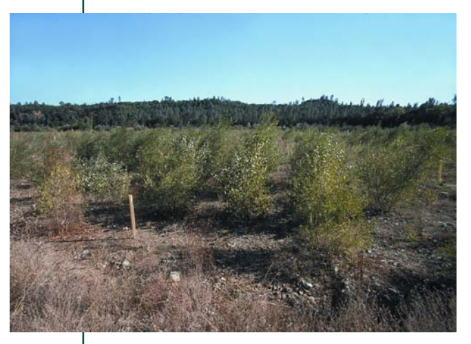
Restoring native forests and other habitats can benefit wildlife and help reduce global warming by storing carbon. (Natural Resources Conservation Service)

Finally, fish and wildlife managers, conservationists and other stakeholders must play an active role in ensuring that all energy development and global warming mitigation projects are managed in a way that prevents or minimizes harmful impacts on wildlife and habitats.