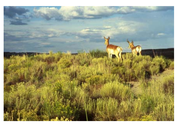
A significant decline in the West's remaining sagebrush habitats due to global warming would have devastating consequences for pronghorn antelope.

For generations, sportsmen have been true champions for conservation, recognizing the importance of fish, wildlife and their habitats to the region's and nation's culture and values. Despite many important conservation successes, however, the American West faces serious and growing problems that have yet to be solved.