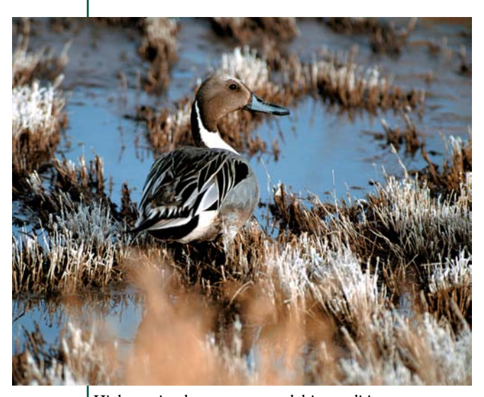
Higher regional temperatures and drier conditions are projected to lead to as much as a 91-percent reduction in Prairie Pothole wetlands by the 2080s, resulting in up to a 69-percent reduction in the abundance of ducks breeding in the region. (Natural Resources Conservation Service)

Global warming also poses a significant threat to the region's diverse wetlands, including areas that provide critical breeding and wintering habitat for waterfowl and other wildlife. The Prairie Pothole