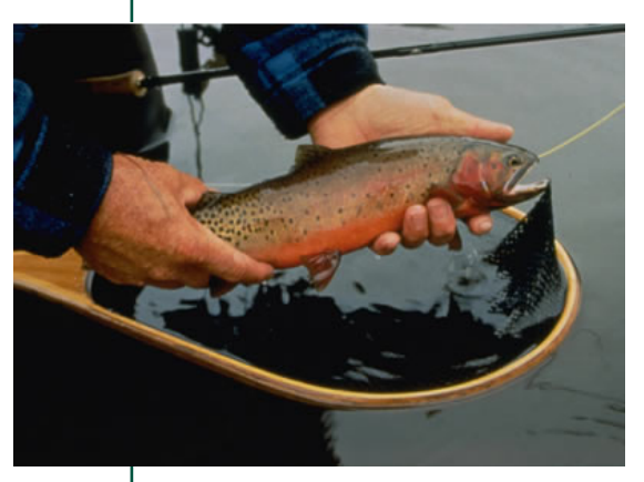
Left unchecked, global warming will contribute to a dramatic decline in habitat for trout, salmon and other cold-water fish throughout the West.

Water temperatures in lakes and streams across the western United States have been on the rise in recent decades, corresponding with a rise in air temperatures. For example, according to the National