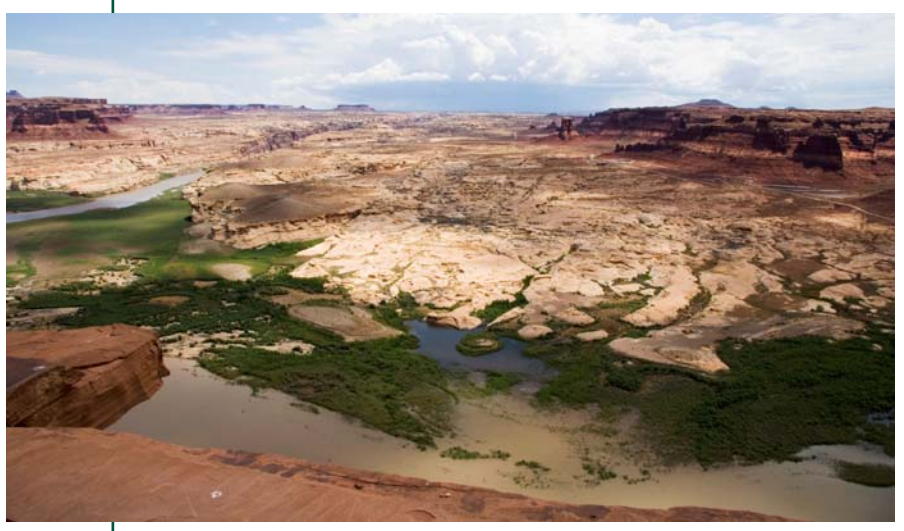
The persistent drought that has been plaguing much of the West is the worst in 500 years. Since the drought began in 1999, water in Lake Powell has declined by 51 percent.

Worsening drought conditions throughout much of the West also have had a significant impact on wildlife. According to the U.S. Geological Survey, the persistent drought that has been plaguing the interior West over the past few years is the worst in 500 years, particularly in the Colorado River Basin.<sup>18</sup>