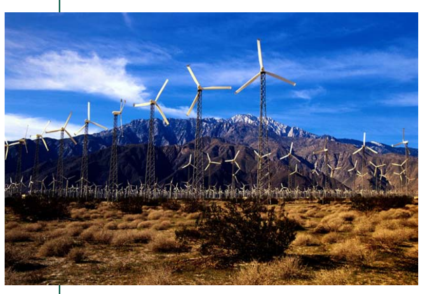
There is tremendous potential for clean, renewable energy sources such as the wind to diversify the West's energy portfolio, creating economic opportunities in the process.

There are a number of actions that the region and nation can undertake to help improve energy efficiency and the use of clean, renewable energy resources. Measures such as implementing stronger efficiency standards for air conditioners, appliances and motor vehicles and offering incentives for the purchase of energy efficient technologies would not only reduce global warming pollution and lessen