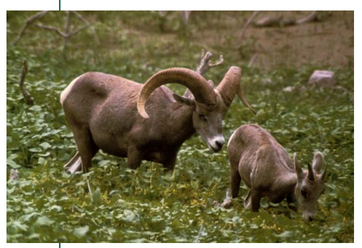
Populations of desert bighorn sheep are among the wildlife species that could face extinction if global warming continues unabated.

average precipitation in southeastern California over the period contributed to a significant reduction in forage, particularly in the lower, drier mountain ranges.<sup>51</sup> Consequently, of the 80 known populations of desert bighorn sheep in the region, 30 populations became extinct over the period. The study projects that a 3.6 degree Fahrenheit increase in average temperatures and a 12-percent decrease in precipitation due to global warming will significantly increase the probability of extinction in the next 60 years.