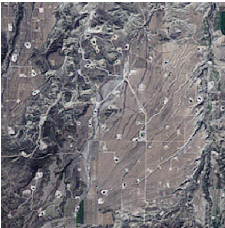
Satellite\ images\ showing\ the\ sage/grasslands\ of\ Jonah\ Natural\ Gas\ Field\ in\ the\ Upper\ Green\ River\ valley\ of\ Wyoming\ before\ development\ in\ 1986\ (left)\ and\ after\ development\ in\ 2005\ (right).\ (SkyTruth)

declined by an average of 51 percent from the year prior to development, compared to a three-percent decline at undisturbed leks. In addition, females nesting in developed areas had significantly lower survival rate than those in undeveloped areas. The study concludes that if the current rate of population decline continues, sage grouse would likely be gone from these areas entirely within 19 years.