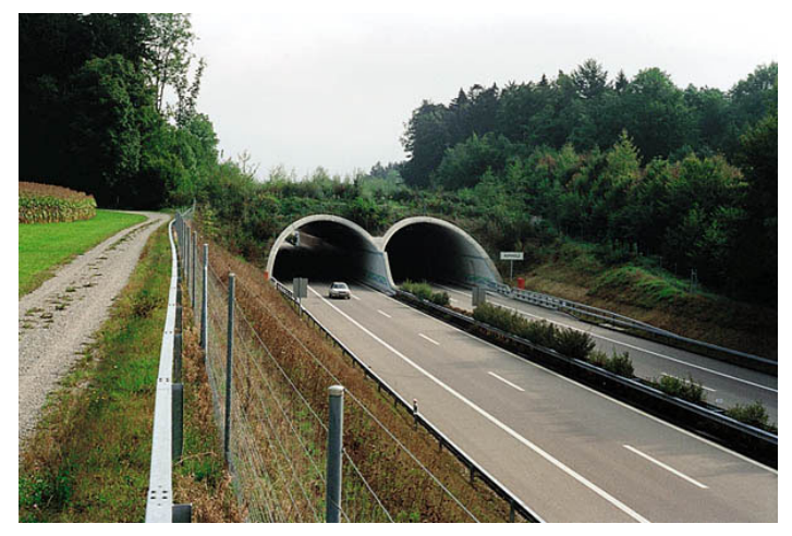
Maintaining connected habitats and providing migratory corridors will help make wildlife more resilient to changes in their environment.

strategies to help species and ecosystems cope with some changes that are inevitable, as well as build in the flexibility to deal with those impacts that may be unforeseen. In many cases, continuing to focus attention on reducing nonclimate stressors such as habitat fragmentation, pollution and invasive species will also help fish and wildlife become more resilient to the effects of global warming. However, failure to take the known and potential impacts of global warming into consideration in fish and wildlife management plans and other relevant resource management activities will make it much more difficult, if not impossible, to meet important conservation goals.