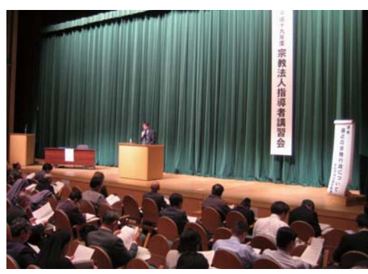
A lecture for leaders of religious juridical persons

In addition, as regards so-called inactive religious juridical persons, the Agency promotes the resolution of their inactive state through merger and dismissal.