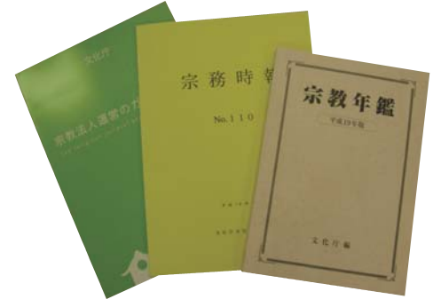
The "Religion Yearbook" and other publications

In addition to collecting statistical data concerning religion, the Agency for Cultural Affairs also complies and publishes the annual "Religion Yearbook" and other publications.