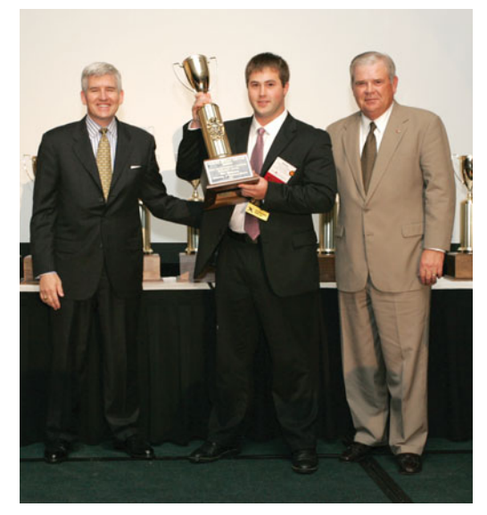
Eta Omicron Chapter (Louisiana-Monroe) receives the Dynasty Level Smythe Award.

While business was in recess, many ΠKAs were able to go out and enjoy the sights and local flavors of Orlando while self-proclaimed hackers and local alumni participated in the convention golf tournament at the beautiful Disney Lake Buena Vista Golf Resort. In addition, several attendees also participated in a community service project benefiting the Give Kids the World Village. This non-profit resort helps to create magical memories and helps to fulfill wishes for children with life-threatening illnesses and their families. In total, more than $1,000 and over one week of time was donated in just a few short hours to Give Kids The World (see page 10).