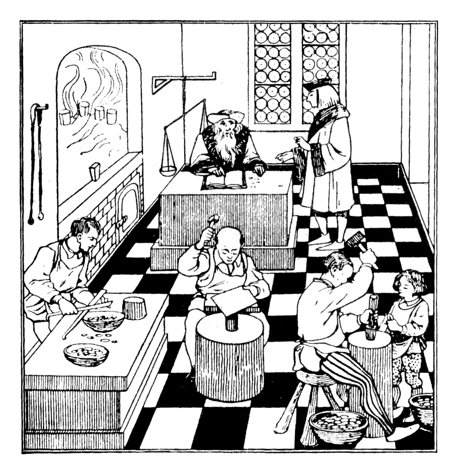
COINING IN PARIS c. 1500 (From a French print c. 1755)