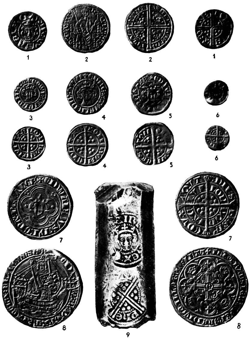
COINS, AND A TRIAL PLATE FOR 1279 COINAGE

1. Henry III long-cross penny 1247-8. 2. Henry III gold penny 1257. 3. Edward I halfpenny 1280. 4. Edward I penny 1279. 5. Edward I penny 1270. 2. Edward I penny 1280. 4. Edward I penny 1279. 5. Edward I penny (Hull) 1300-2. 6. Edward I farthing (base) 1279. 7. Edward I groat 1280-5. 8. Edward III gold noble 1346-51. 9. Surviving portion of standard of 1279 (enlarged 5:4). This has the imprint of the old coinage, but that of the new is unfortunately missing, presumably because the pieces for assay were taken from that part. All coins are silver, actual size, and London Mint, except where otherwise stated.