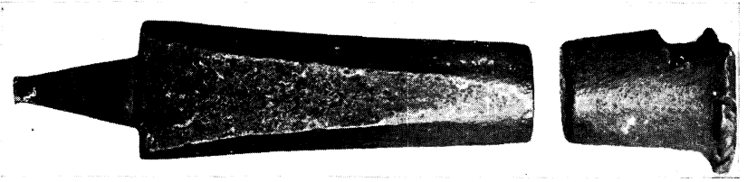
MEDIEVAL DIES (scale 1:2 approx.)