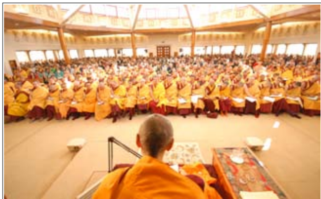
The Temple at NKT-IKBU International Festivals at Manjushri KMC, England

Every year at the NKT-IKBU International Spring and Summer Festivals at Manjushri KMC in the UK, people gather together from around the world to attend teachings and meditation sessions. There are also Festivals and Dharma Celebrations in many other countries around the world. These events are regarded