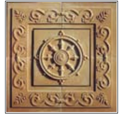
Benefit others by turning the Wheel of Dharma

According to the 2007 edition of the NKT-IKBU Directory of Kadampa Buddhist Centres and Branches there are about 1,100 main NKT Centres and branches worldwide. In the UK there are presently 47 Dharma Centres, all of which are registered charities, and about 320 branches of these Centres. All NKT Centres are listed in the NKT-IKBU Directory , which is updated each year. A database of Centres is also maintained on the NKT-IKBU website.