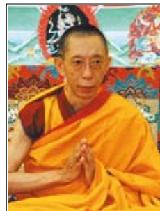
Venerable Geshe Kelsang Gyatso

Later he joined Sera Je Monastery near Lhasa, where he engaged in further Geshe training studies. After that, in India he mainly emphasized retreat for meditation purposes. While living in the mountains near Dalhousie in northern India he received a letter from Sera Je Monastery in south India, encouraging him to go there for examination. He did not attend at that time