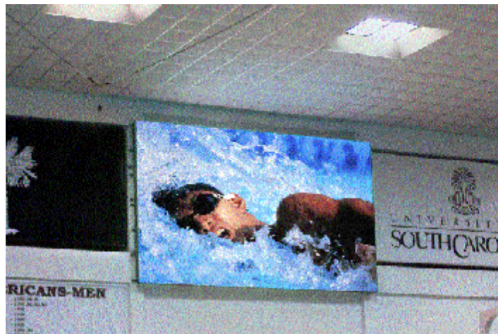
University of South Carolina | Blatt Education Center 35mm Video Display