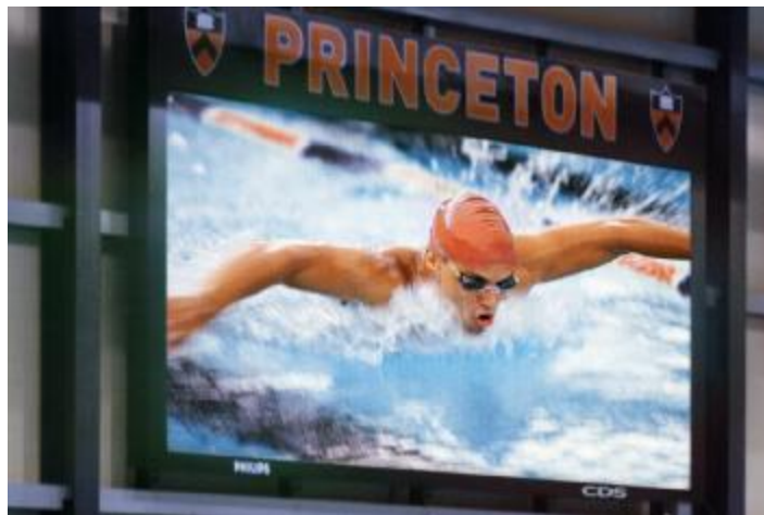
Princeton University DeNunzio Pool | 25mm Video Display