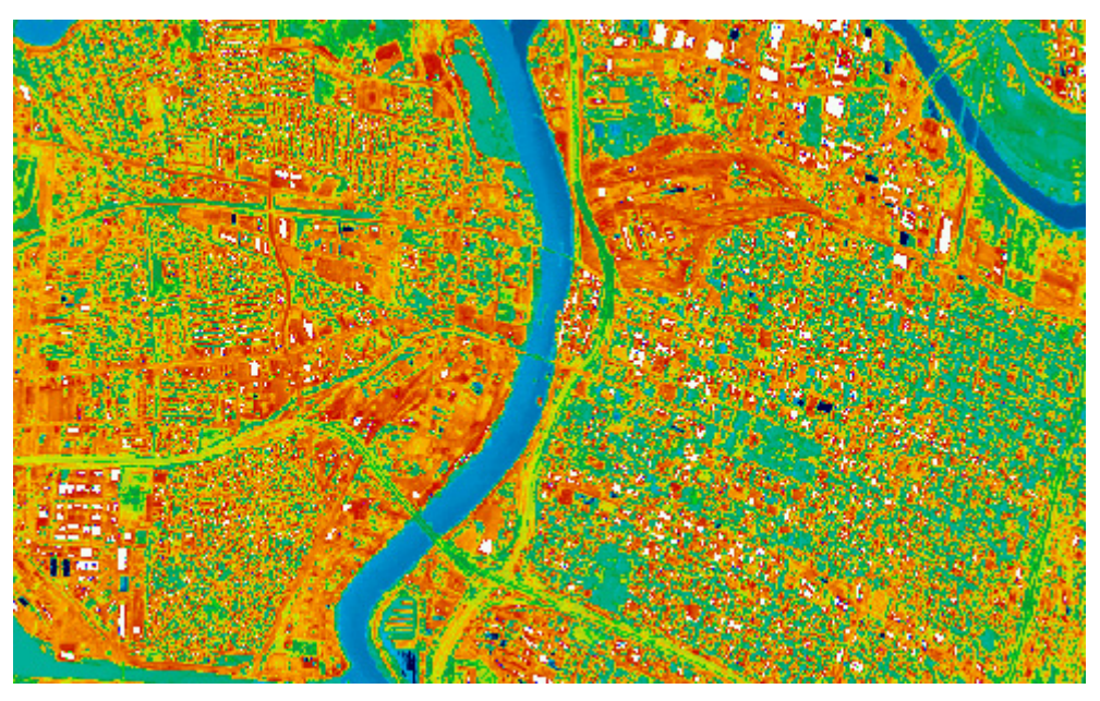
Figure 1 - Sacramento's summer heat in false-color infrared image. Taken June 29<sup>th</sup>, 1998 by Urban Heat Island Pilot Project (UHIPP). Green areas are about 30°C and white areas about 60 ^{\circ}C <u>http://science.msfc.nasa.gov/newhome/headlines/essd01jul98_1.htm</u>

The urban heat island effect has several causes: