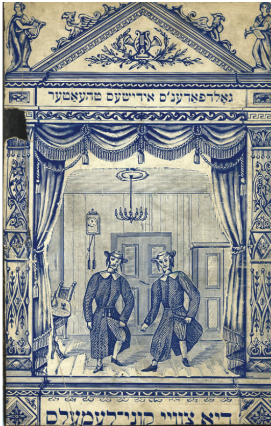
Title page from the Warsaw edition of Goldfaden's Di tsvey Kuni-Lemls , 1887.

So ingrained did Goldfaden become in Yiddish culture that he added new words to the Yiddish vocabulary, and his best-known songs were often perceived as Yiddish folklore. Though not included in standard Yiddish dictionaries, words like shmendrik and Kuni-Leml entered Yiddish slang. They also turn up in Leo Rosten’s The Joys of Yiddish , which offers six different meanings of shmendrik and illustrates the usage of a Kuni-Leml with the saying, “He is the kind who looks for a notch in the saw.” Meanwhile, Goldfaden songs like “ Rozhinkes mit mandlen ” – itself inspired by a folk song – seemed to spring spontaneously from a thousand years of Yiddish cultural expres-