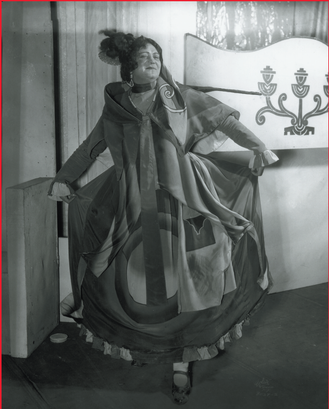
A dancer in Maurice Schwartz's production of The Tenth Commandment at the Yiddish Art Theatre (NY), 1926.

statement. Yekhezkl Dobrushin's text added a scene that was in itself a manifesto. As rain falls in the marketplace, we hear voices calling out: