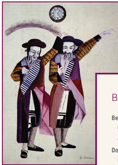
Boris Aronson's costume design for The Tenth Commandment at the Yiddish Art Theatre (NY), 1926.