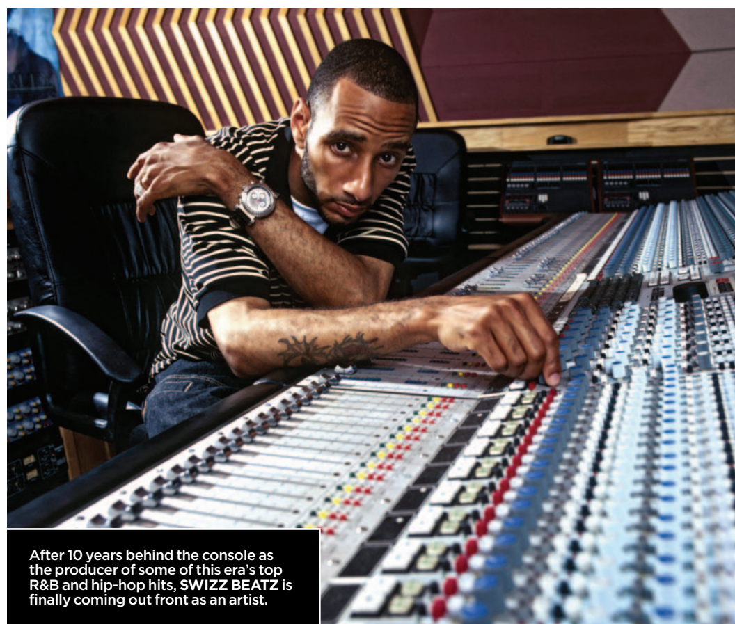
After 10 years behind the console as the producer of some of this era's top R&B and hip-hop hits, SWIZZ BEATZ is finally coming out front as an artist.