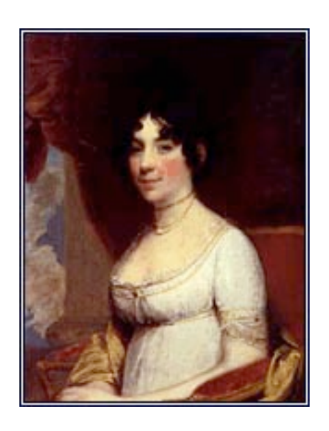
Portrait of Dolley Madison

Dolley Madison, the White House, and the War of 1812