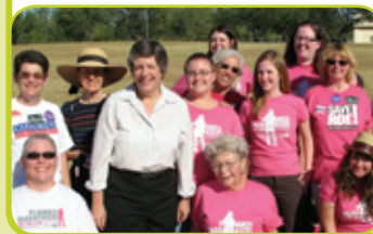
Governor Napolitano joins the Voter Mobilization Weekend Canvass in Tucson

course was chock-full of brightly pink-clad Planned Parenthood volunteers!