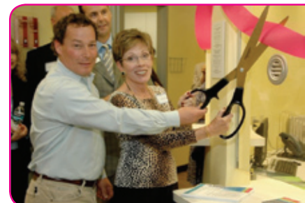
Maryvale Health Center Grand Opening