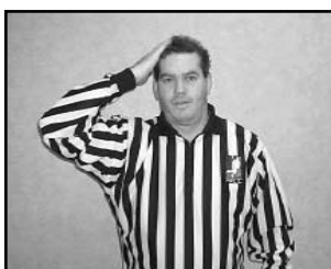
Illegal Contact to the Head Grant Spies 12 th year