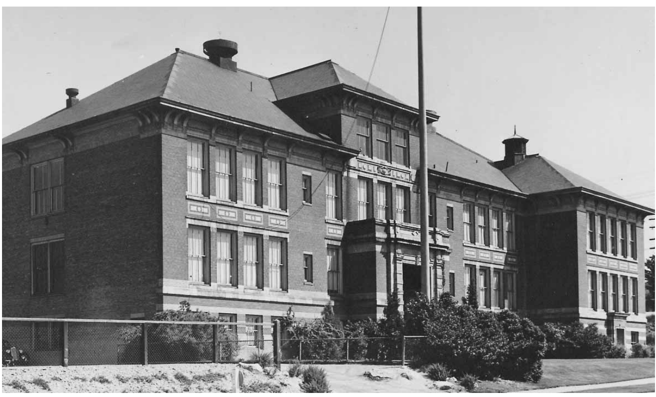
Jefferson, ca. 1945 SPSA 238-253

School enrollment continued to grow. In 1917–18, Jefferson held 443 students in 13 classrooms. The grounds were enlarged and the following September Jefferson was one of five Seattle Public Schools to