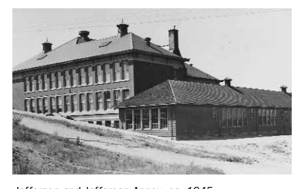
Jefferson and Jefferson Annex, ca. 1945