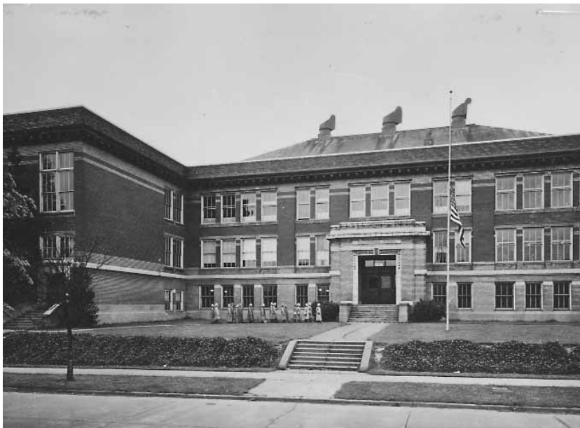
McDonald, ca. 1925 SPSA 247-33

McDonald was once again called into service as a school building in fall 1998 when students in the TOPS alternative program moved in while awaiting the renovation of their home at Seward. Stevens students moved into McDonald in fall 1999 during the reconstruction of their school building. Stevens will be reopened in September 2001. McDonald will continue to be used as an interim site for the foreseeable future.