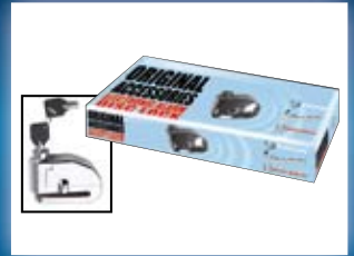
Disc Lock with Alarm