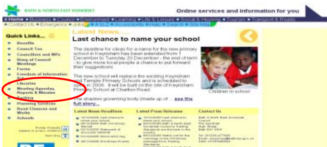
Fig 1 – A public authority's homepage should, wherever possible, provide a direct link to the Freedom of Information pages. This screenshot shows a link to Freedom of Information from the Bath and North East Somerset Council website www.bathnes.gov.uk 3 .

You should also consider accompanying such links with the Freedom of Information logo (see Figure 3 below). The Freedom of Information logo has been registered with the Patent Office in the name of the Department for Constitutional Affairs for use by all public authorities that are subject to the Freedom of Information Act 2000. The logo may be downloaded from http://www.foi.gov.uk/logos/foiologo.htm .