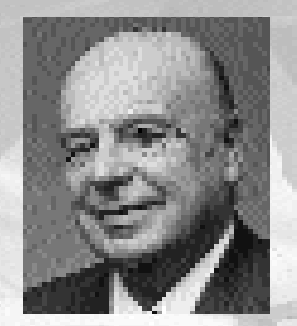
Dr Primo Nebiolo

delegates. Congress is the IAAF's ultimate authority and its key functions include: