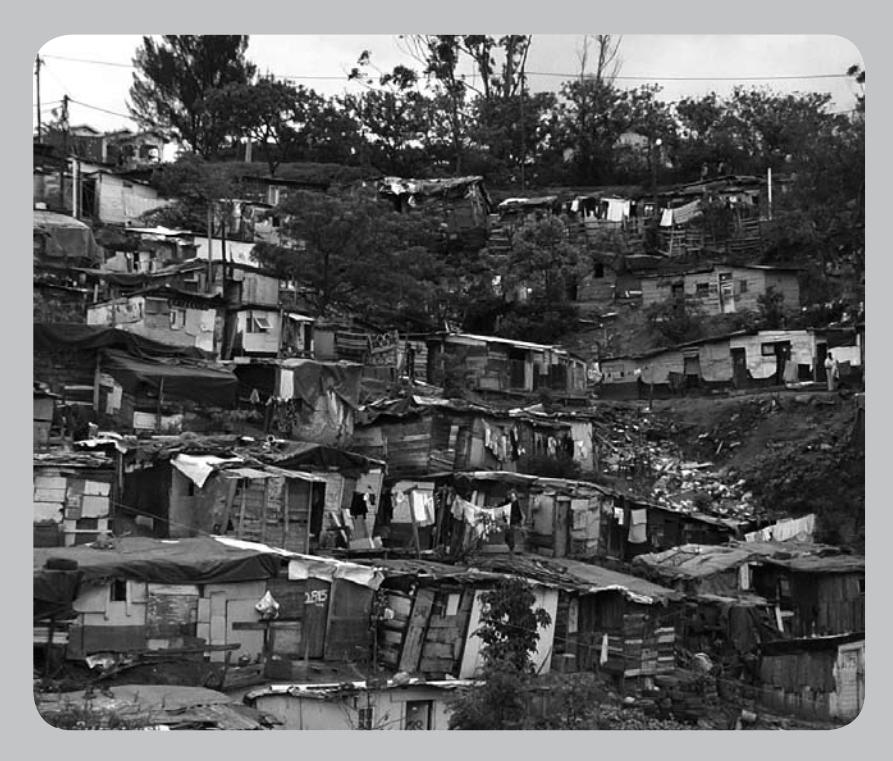
Kennedy Road settlement, Durban, South Africa