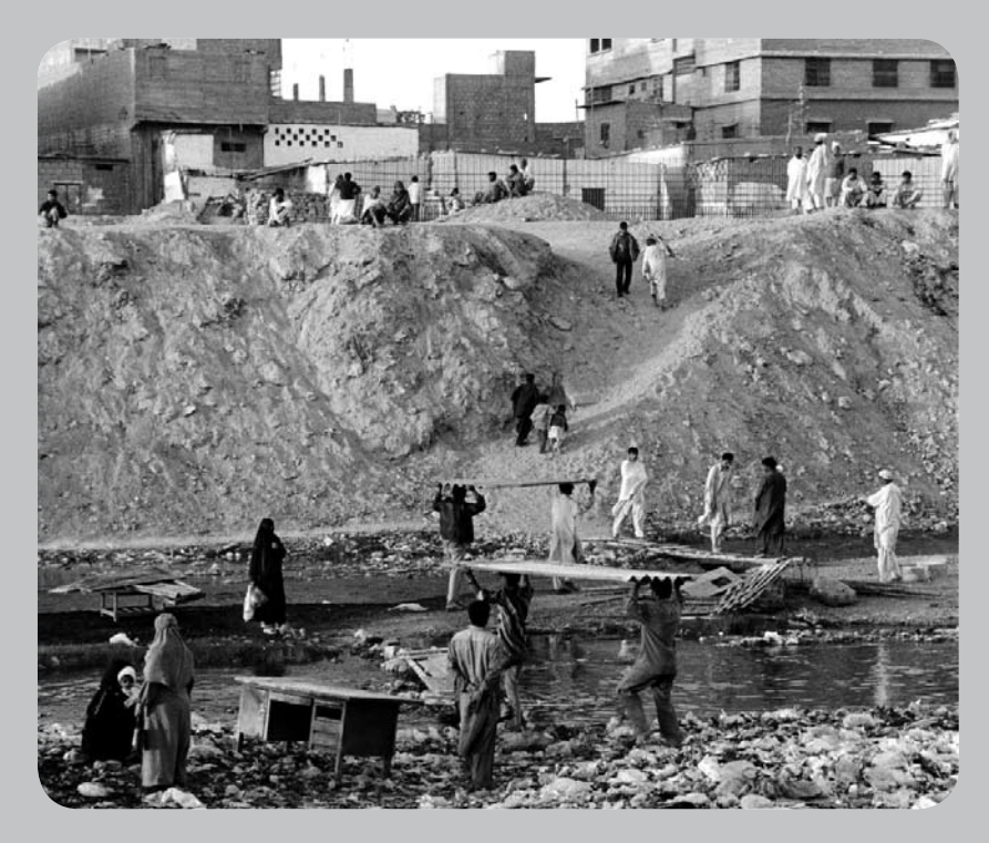
Forced evictions for the Lyari Expressway, Pakistan