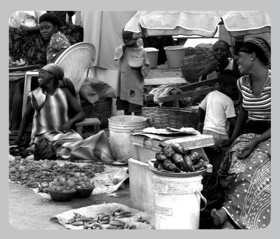
Lugbe informal settlement market, Abuja, Nigeria