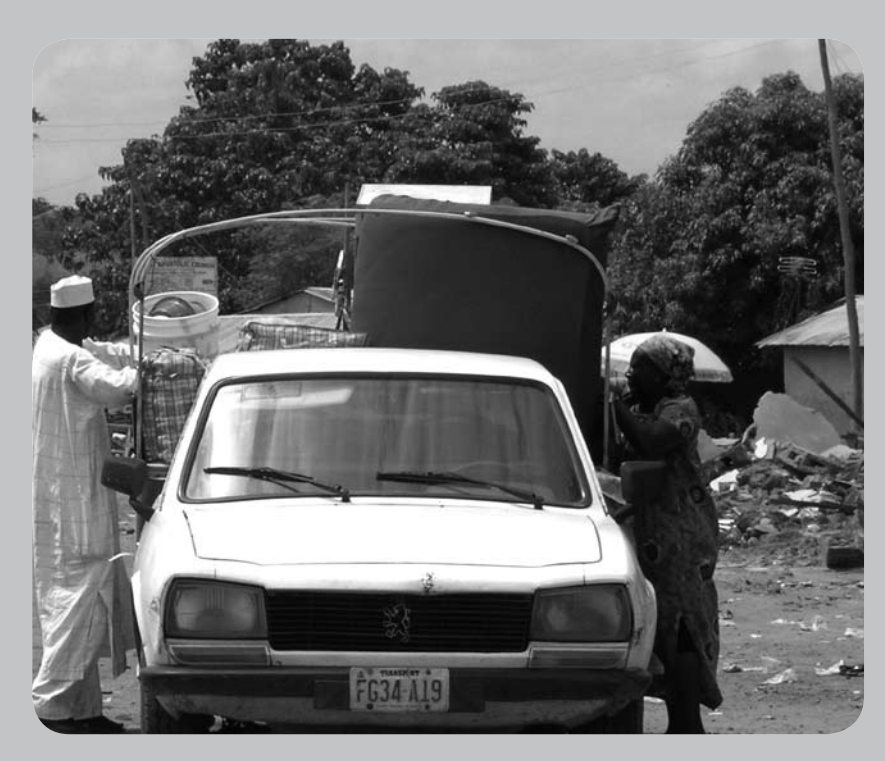
Forced evictions in Aleita, Abuja, Nigeria