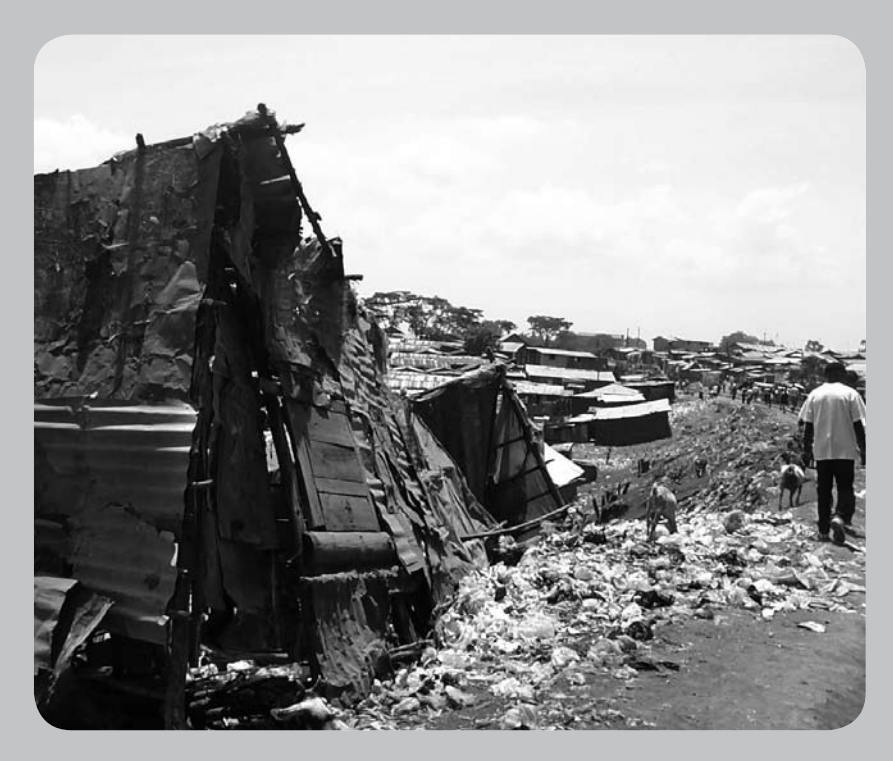
Kibera, Nairobi, Kenya